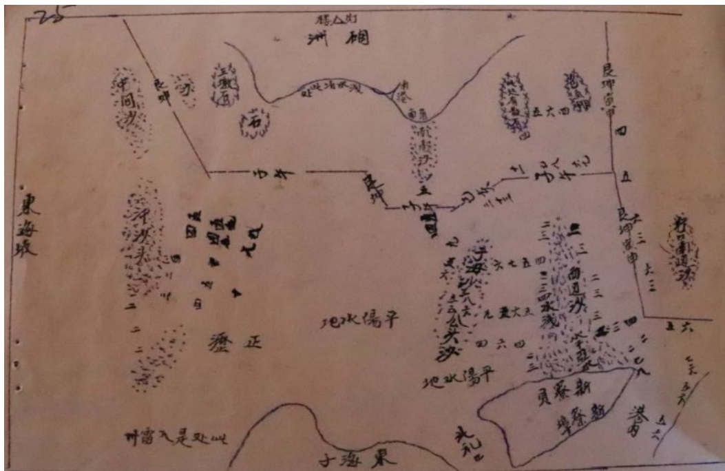
(This is page 25 of Zheng Changmei 's copy of " Liushui Genglubu ", The map shows the ports, routes, voyages, mountain shapes and water potential along the route from Guangdong to the East China Sea.)

as hidden row, clear row, reef cornerstone, coarse sand, fine sand, sand land, sand mud land, mud land, Pingyang water land, Zhengli, Dashui... Bracket, water depth... A foot, offshore... Pitching, dark water all the way, etc. As shown in the figure on page 25 of this book, the map of mountain shape and water potential in Guangdong is drawn, including the mark of Naozhou lighthouse, ' here is scattered sand ', ' shallow water here ', ' Pingyang water ', ' water dry ', ' shallow water ', Zhengli and other geological conditions, water potential drawing.