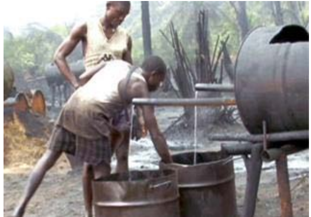
Figure 1: Showing transportation of illegal crude, Figure 2: Showing the production of illegal crude

While it is assumed that the incidence of oil bunkering is carried out by a cluster of unemployed youths as a mechanism for survival, the reverse might be the case as noted by lkelegbe (2005) who revealed that: