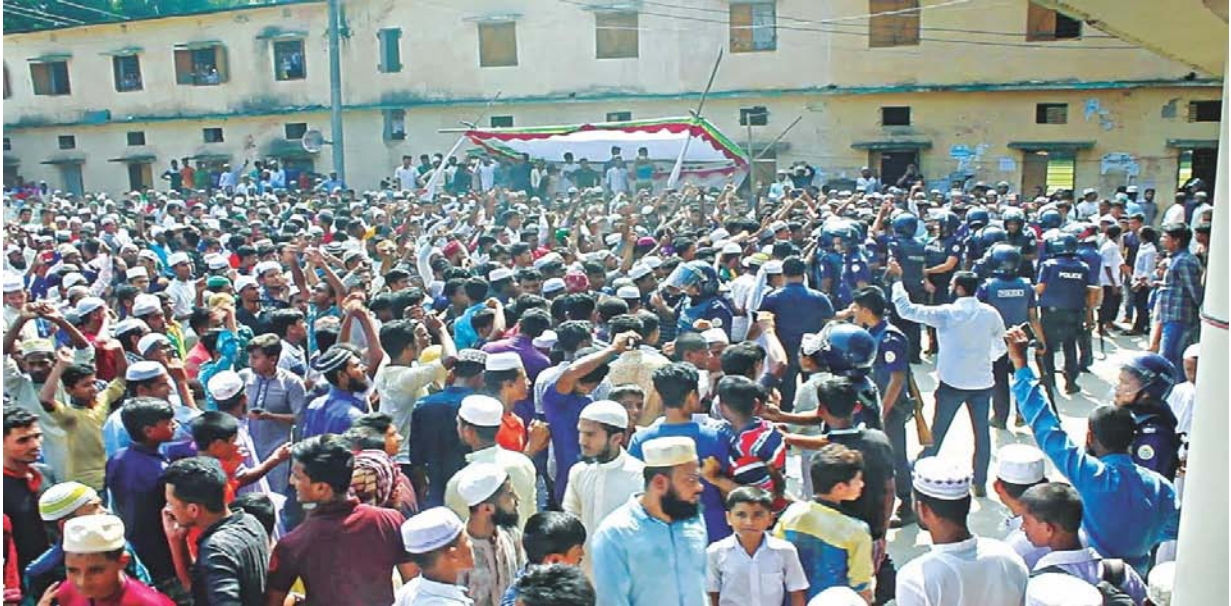
Figure 1: Visual representation of the impact of rumors on Facebook in Borhanudding, Bhola.

in 2016, and Horkoli Thakurpara in Rangpur in 2017 (21 October 2019; Daily Star).