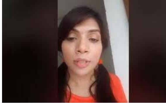
Nowshaba was on Facebook live.

Her 1.37 minutes long live video went viral on Facebook, which made many aware citizens confused authors whether it was true or not. Later she was arrested by RAB (Rapid Action Battalion) accused of spreading rumor (4 August 2018; bdnews24.com).