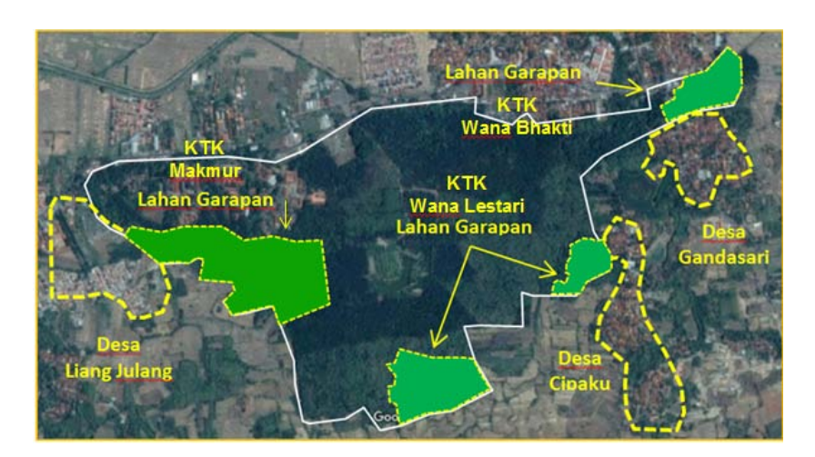
Figure 3. Cultivated Land Map for Three KTH

Strategy stages for building community organizations Based on the results of the research, on strategies to build community organizations, the process mechanism and its stages are in accordance with science refer to the theory of experts or based on combination between the results of analytical research and scientific research, it must be planned to get the change for the better one. If there is already a community organization, the next analysis is comparing to the expert theory. The strategy to build a forest management community organization is more effectively and efficiently through the appropriate stages, planned according to the situation and conditions as well as the environmental supporting capacity of the community organization. Based on the research results and referring to the theory of building a more effective community organization, according to Michael Jacoby Brown (2006: 25-60), it is necessary to pay attention to the seven stages. The detailed process of building a community organization from each process, the stages and the explanation are as follows: