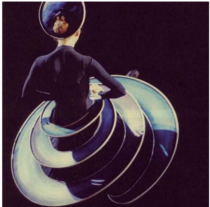
Figures 1 and 2: Triadic Ballet . Oskar Schlemmer, 1922