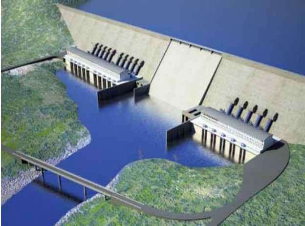
Figure 1: Rendition of the Grand Ethiopian Renaissance Dam (GERD)

the then Prime Minister (Mr. Meles Zenawi) of Ethiopia. The project is owned by the Ethiopian Electric Power Corporation (EPPCO). The planning phase of the project was carried out under the name called Project X, which was later changed to Millennium Dam and finally to the present name (Grand Renaissance Dam, or just Renaissance Dam).