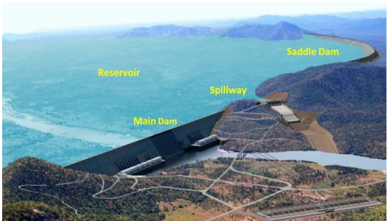
Figure 4: Main Dam and Saddle Dam of GERD

water to the Nile River. Sewilam asserted that some Egyptian researchers are currently working in different concentrations, such as water treatment, water recycling, increased irrigation efficiency, and desalination. El-Baradei also said (HornAffairs, 2016) that the Government of Egypt needs to consider using groundwater wells as a water resource, but only after treating the saltwater. Sewilam, however, believes that the solution ultimately lies in greater cooperation between the Nile Basin's countries to secure water and other natural resources (HornAffairs, 2016). "There should be an integrated Water-Energy-Food Nexus plan for all the Nile Basin countries. We should be thinking of self-sufficiency of resources by complementing each other, as for example, we need to identify the countries in the Basin which can generate energy and other countries which can supply water and also the countries that can make use of water and energy to produce enough food for the whole basin" (HornAffairs, 2016). "I think the lack of trust, cooperation, and participatory long-term planning between all the Nile Basin's countries are the main reasons for the current situation" (HornAffairs, 2016). "The main Dam is allocated for generating electricity while the side Dam is just for water reserves and it won't affect the power generation process of Ethiopia if the amount of the reserved water is reduced" (HornAffairs, 2016). The GERD's both main and saddle dams are shown in Figure 4.