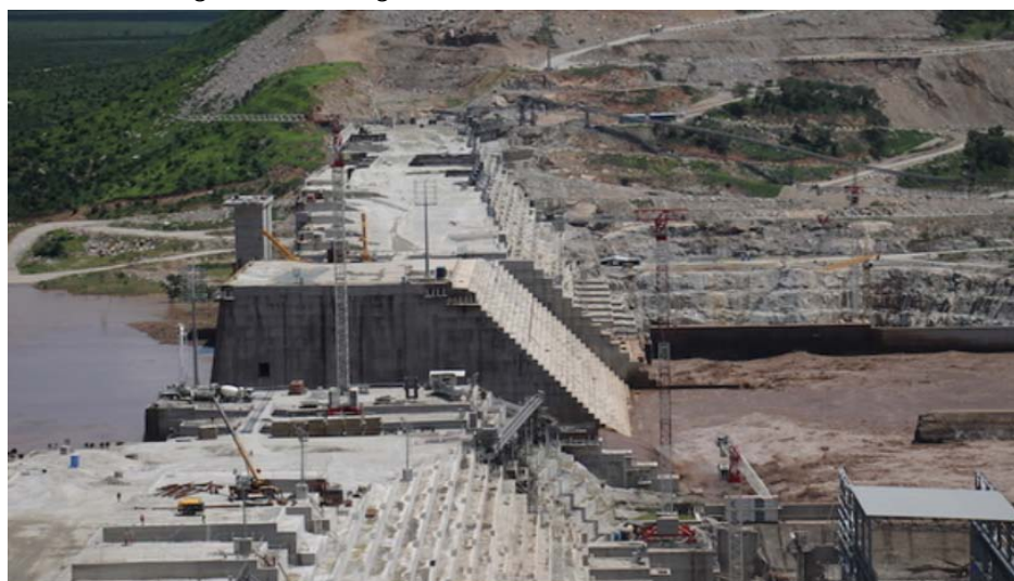
Figure 3: Overview of GERD on July 31, 2016

The Italian company (Salini Costruttori) was awarded the project which has already worked on other projects such as the dams of Gilgel Gibe II, Gilgel Gibe