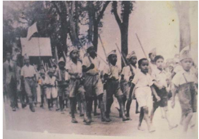
Fig. 2 : A group of Indonesian Ants Army

Then he set up the Angkatan Pemuda Insaf (API) in 1946. API is a youth wing of MNP. Through API, his leadership was increasingly evident. He was able to travel all over Malaya to seek support and developed API influence. ii API had a very radical and was listed by British as a political organization which endangered British's position in Malaya. British also categorized API as equivalent to CPM by allegations that there were close cooperations between the two organizations. This charge was listed in Malayan Security Service report (Malayan Security Service.1947).