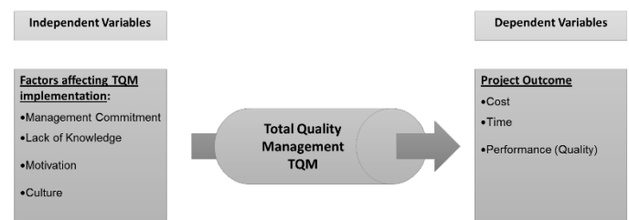
Figure 1: Research Model

The following model which is presented in Figure 1 will be used in the study.