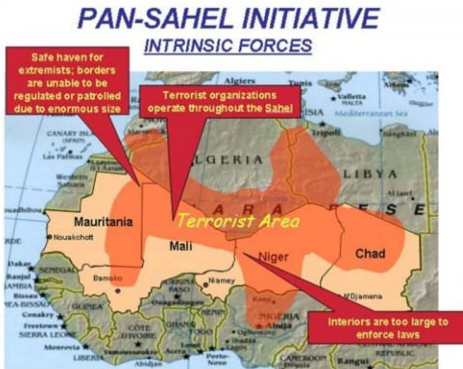
Figure 1: Map Showing AQIM's Areas of Operation

Adopting the name Al-Qaeda brought the GSPC the instant support of tens of thousands of online Jihadists, many of who now perceive the group as fighting on behalf of Al-Qaeda. [8] As indicated by Ait-Hida and Brinkel, seeing itself as a religiously motivated organization, "AQIM's public declarations begin with citations from the Koran and Hadith Religion plays a role in the recruitment of members, the legitimization of extreme violence and in the internal debate on the selection of targets of attacks". [9]