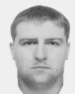
Fig. 1. The EvoFIT (left) and person (right) convicted in the 'Beast of Bozeat' case. Shortly after the crime, the perpetrator is believed to have changed his hairstyle in an attempt to conceal identity, as illustrated here.

An evaluation of this version of the software was carried out. Fifty laboratory-witnesses saw a photograph of a footballer whose face was unfamiliar to them, and two days later described the face (using a CI) and constructed a composite with EvoFIT or a traditional feature system. The resulting images were then given to football fans to name. Among witnesses who attempted to remember the face in detail, EvoFITs were correctly named at 11% and feature composites at 4% (Frowd et al., 2007b). In subsequent research (Frowd, Bruce, Plenderleith & Hancock, 2006b), we asked the same person to use the system more than once to construct a likeness of the same target face. There was good consistency of results, as Fig. 2 illustrates. When used in this way, the faces the user sees at the start change for each attempt—they are different random faces—and so the search process is also somewhat different each time, as is the resulting image.