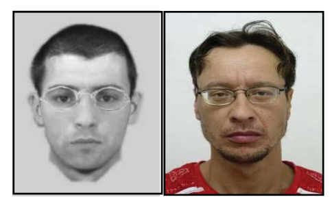
Fig. 7. The left image is an EvoFIT produced by a 10 year old victim of robbery; the right image is a recent photograph of the person convicted.

Mobile phone thefts: Between May and August 2009, a series of very similar crimes was committed against minors, particularly against those aged 12 years and under. The offender in this investigation chose buildings with an elevator, to enable him to follow his victims into the elevator. Between floors, he stopped the lift and, under threat of violence, stole the young person's mobile phone. One of the victims, a 10-year-old girl, was interviewed to construct a composite of the offender. She could not describe the robber's facial features—a problem arising for many victims—but was able to produce an EvoFIT. The 23 to 35 year Eastern European male database was used; the resulting image is shown in Fig. 7.