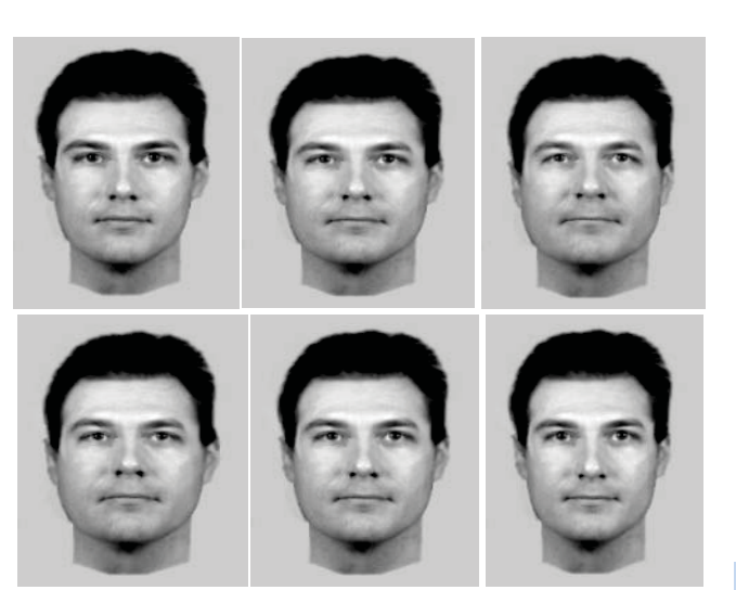
Fig. 4. An example of the ageing (top row) and pleasantness (bottom row) holistic scales. Manipulations increase in magnitude from left-to-right and are illustrated on an EvoFIT of TV celebrity, Simon Cowell.

Following development of these age-constrained databases, users still sometimes evolved faces with inaccurate ages, though to a lesser extent than before. We sought to overcome the problem by providing a sliding scale for adjusting composites' perceived age, and extended this facility to allow adjustment of other whole-face properties. These so-called holistic tools face weight, masculinity, included threatening. attractiveness, honesty and extroversion. See Fig. 4 for examples, and Frowd, Bruce, McIntyre, Ross and Hancock (2006a) for a description of how the scales were designed. Further scales were developed to add stubble, eye-bags and deep-set eyes, and to alter the greyscale levels of brows, irises, mouth creases, etc. These holistic tools are used at the end of evolving, after external feature blurring is turned off.