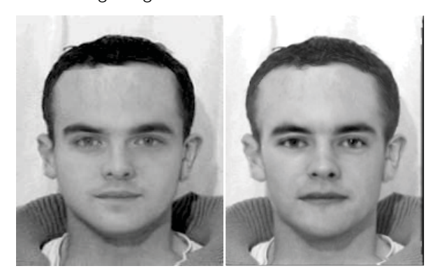
Fig. 2. EvoFIT Images produced of TV presenter, Anthony (Ant) McPartlin. The same person used the system twice to evolve a composite of his face from memory, producing a consistent likeness.

An evaluation of this version of the software was carried out. Fifty laboratory-witnesses saw a photograph of a footballer whose face was unfamiliar to them, and two days later described the face (using a CI) and constructed a composite with EvoFIT or a traditional feature system. The resulting images were then given to football fans to name. Among witnesses who attempted to remember the face in detail, EvoFITs were correctly named at 11% and feature composites at 4% (Frowd et al., 2007b). In subsequent research (Frowd, Bruce, Plenderleith & Hancock, 2006b), we asked the same person to use the system more than once to construct a likeness of the same target face. There was good consistency of results, as Fig. 2 illustrates. When used in this way, the faces the user sees at the start change for each attempt—they are different random faces—and so the search process is also somewhat different each time, as is the resulting image.