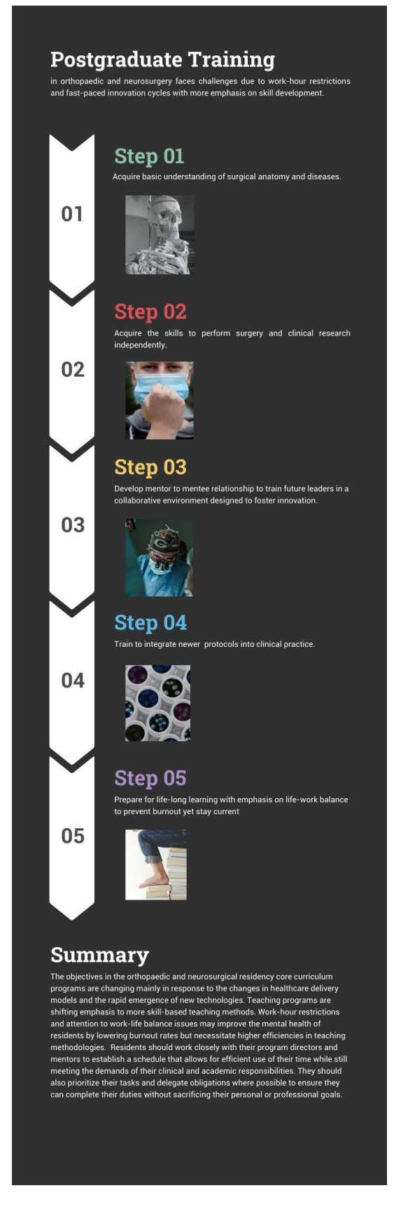
Figure 3. Infographic on shifting emphasis in orthopedic and neurosurgery residency program.