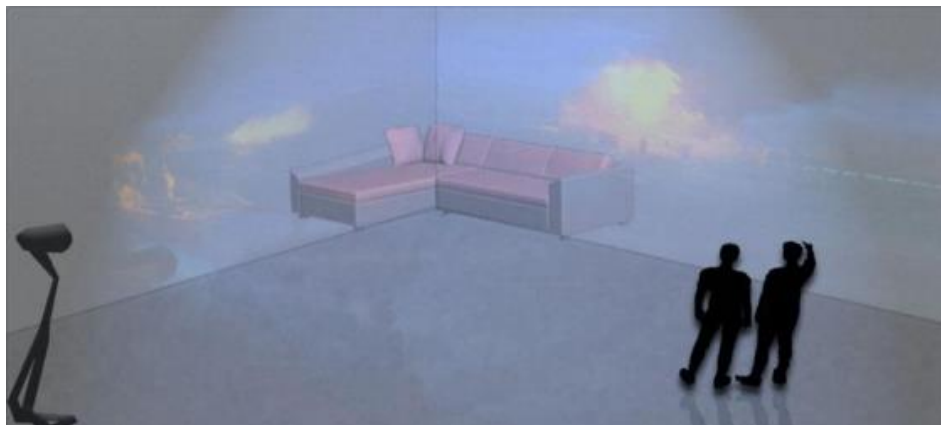
Fig 5. An expected view of projected virtual reality contents (Khan, Ahsan and Hussain, 2017)

Virtual reality (VR) is also becoming more and more important in the construction industry, after devices that truly implement VR in a life-like manner have been put on the market in recent years. By adding the Oculus Rift, HTC Vive and Samsung Gear headsets, the user can enter any 3D simulation and feel as if he is really standing in the designed space (see Fig 5.). During such a tour, you can get an architectural plan accepted, or even sell an apartment much more convincingly, then relying only on plans and photographs.