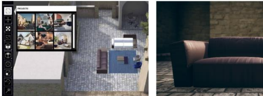
Fig 6. Realistic product presentation to customers based on a feature-rich interface (Florentino et al., 2022)

be created that accurately illustrate function and style, which can be shaped and moulded in the further steps of the design process based on new requests and expectations. Multiple designs and layouts can be pre-designed as required (Nagy, 2022).