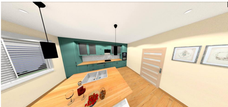
Fig 1. Image produced with VR technology (Vas, 2022)

VR technology creates a fully immersive digital environment, allowing shoppers to experience furniture in a virtual showroom (see Fig 1.). It allows customers to explore different products and configurations, and even change colours and textures in real time. This technology offers a more immersive and interactive experience than traditional shopping methods do, making customers more likely to buy. This kind of virtual experience also requires customers to have special glasses, which are quite expensive. However, there are applications which can transform a smartphone into a virtual reality headset. After downloading the appropriate phone application, we can assemble the entire device with the help of our phone. All we need for this usage is a frame made of cardboard, in which we place the phone.