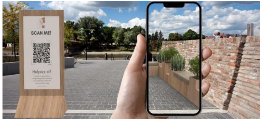
Fig 7. Viral marketing at the Duna Kapu Square in Győr (Nagy, 2022)