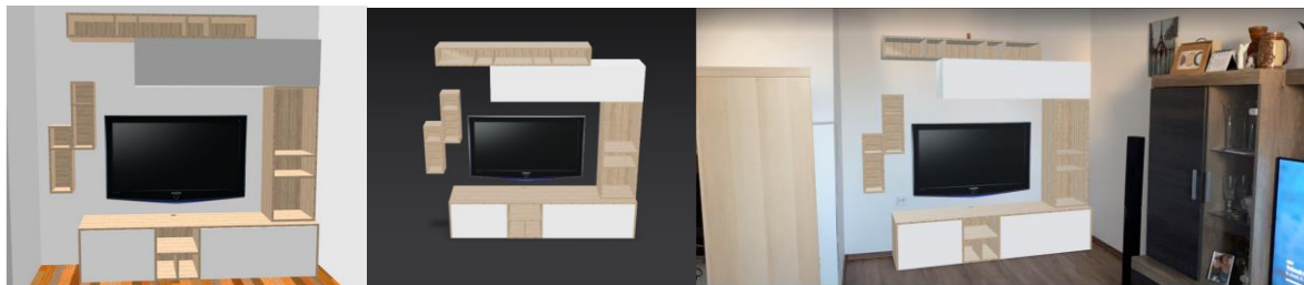
Fig 2. The difference between a 3D visualisation and an AR image (Nagy, 2022)

Augmented reality has science-fiction roots dating to 1901. However, Thomas Caudell described this term as a technology only in 1990 while helping Boeing workers to visualise intricate aircraft systems (Interaction Design Foundation, 2023). AR technology is the integration of digital information with the physical environment, allowing customers to see and interact with virtual objects in the real world. Augmented reality systems combine digital information and the real world in such a way that the user experiences them as one (Gudlavalleti et al., 2022). AR technology can be used to create 3D furniture models that can be superimposed on images or videos of the customer's living space (see Fig 2.). This technology allows customers to see how the furniture will look in their home before they buy it, eliminating the need for physical showrooms or store visits.