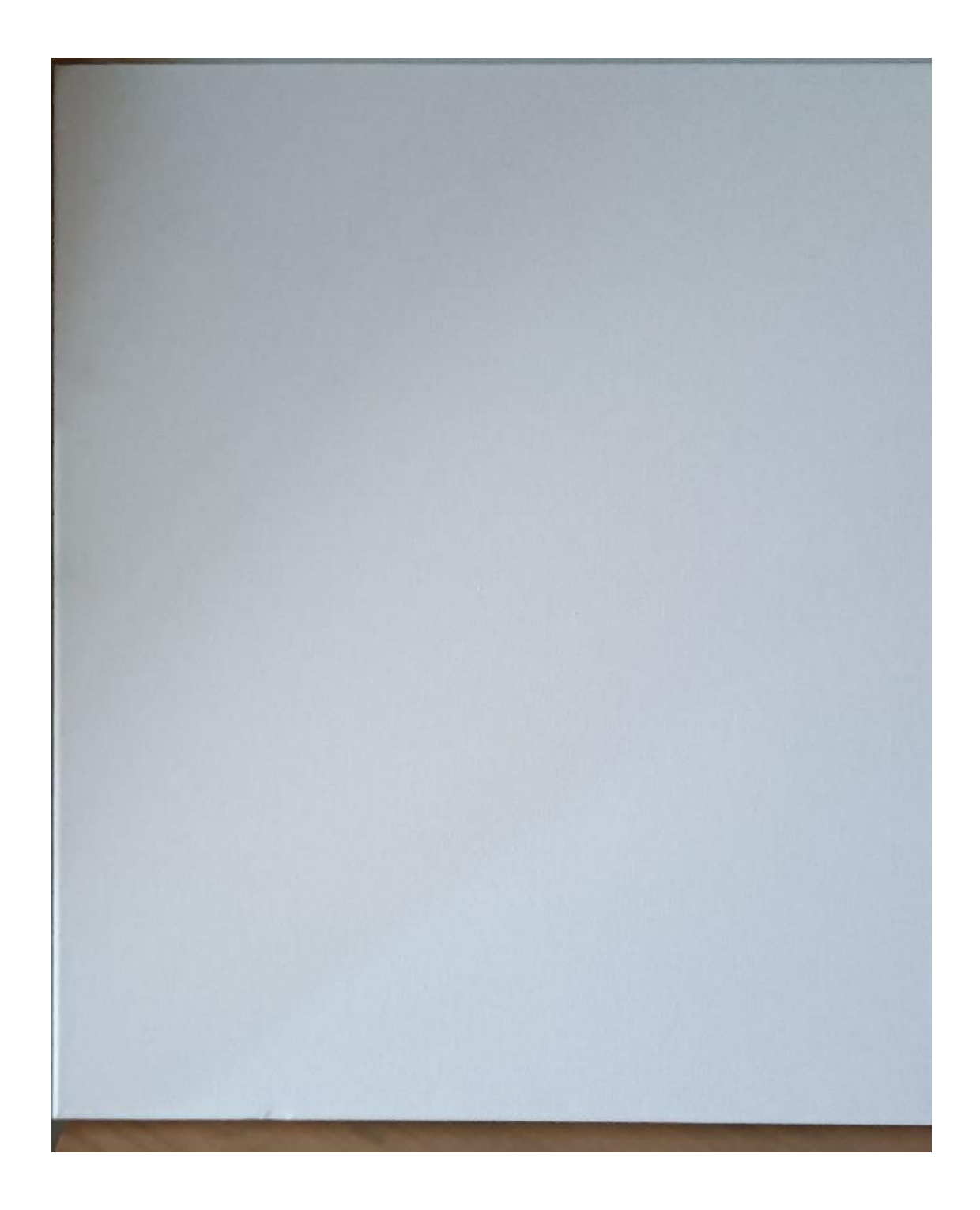
Figure 1: A Blank Canvas