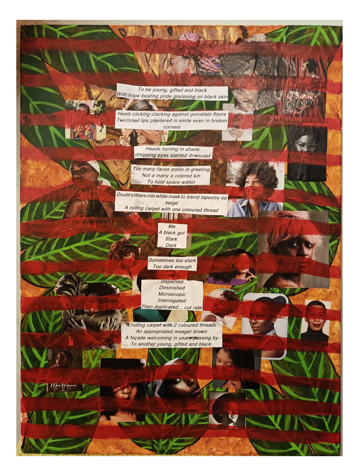
Figure 7: A Voice Burdened & Silenced