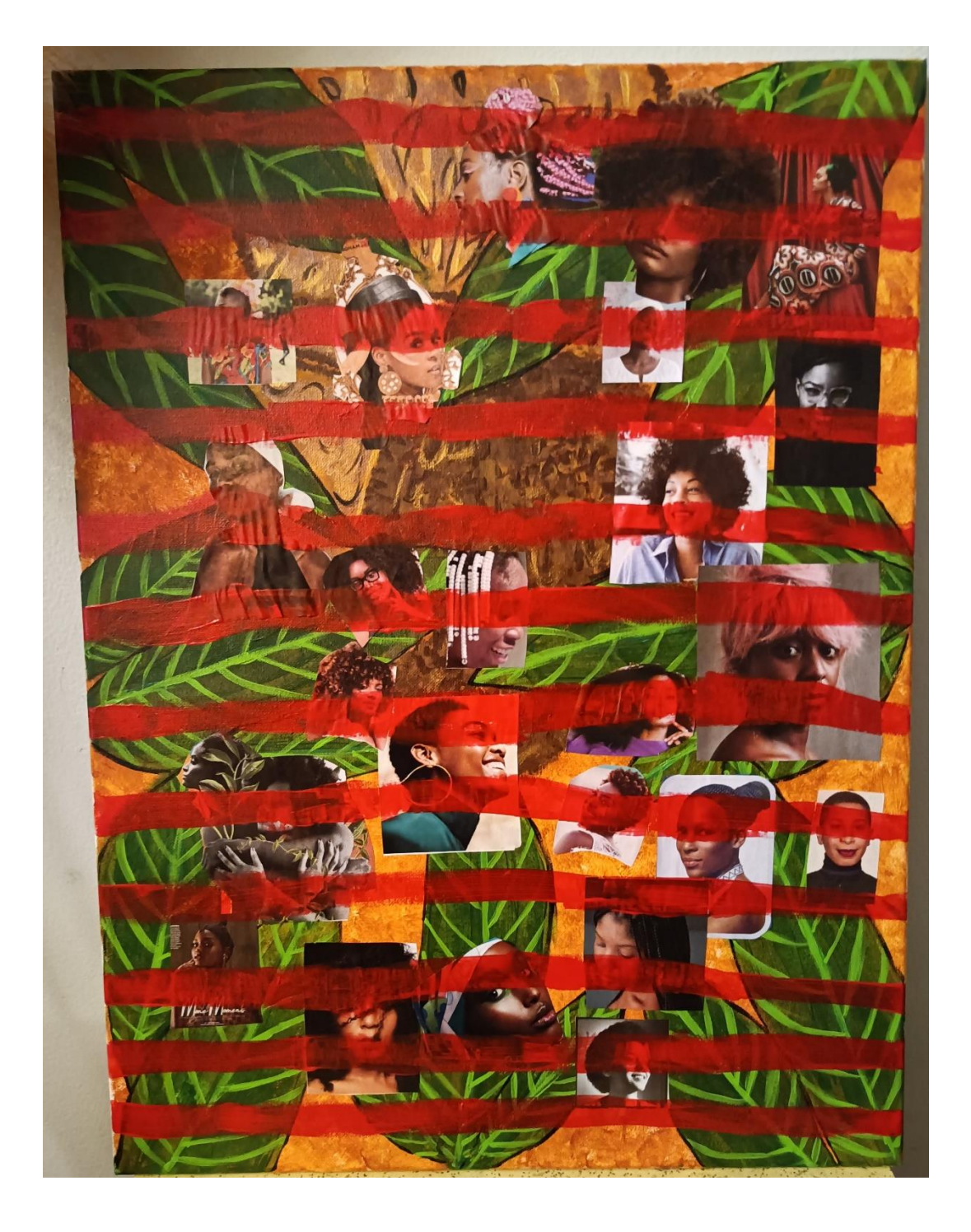
Figure 6: The Red Silencing of My Voice & Theirs