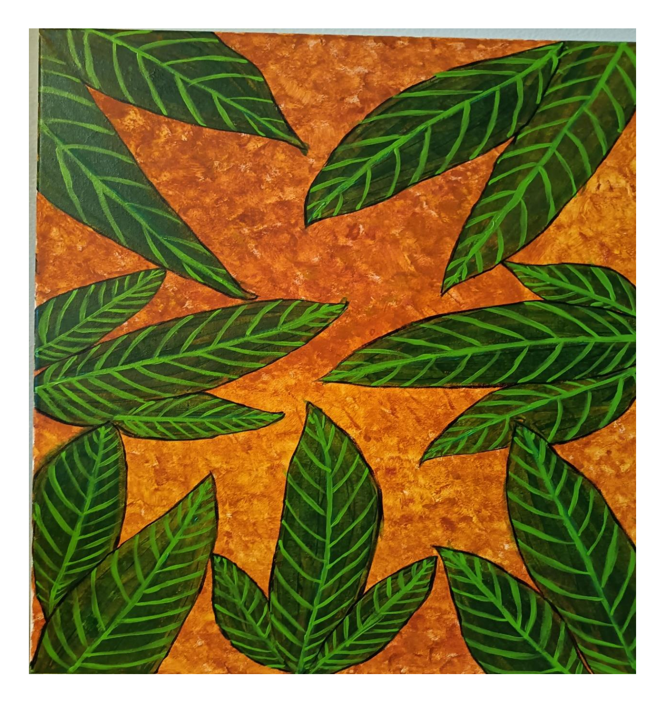
Figure 3: Before the Loss-My Voice Planted