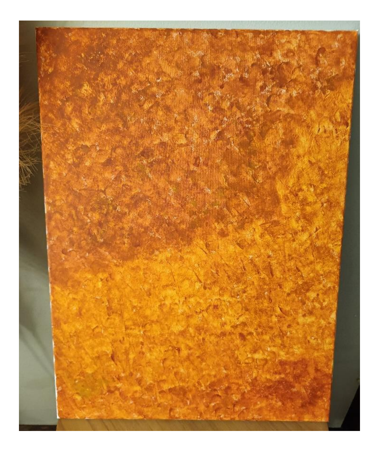
Figure 2: My Afro- Caribbean Heritage