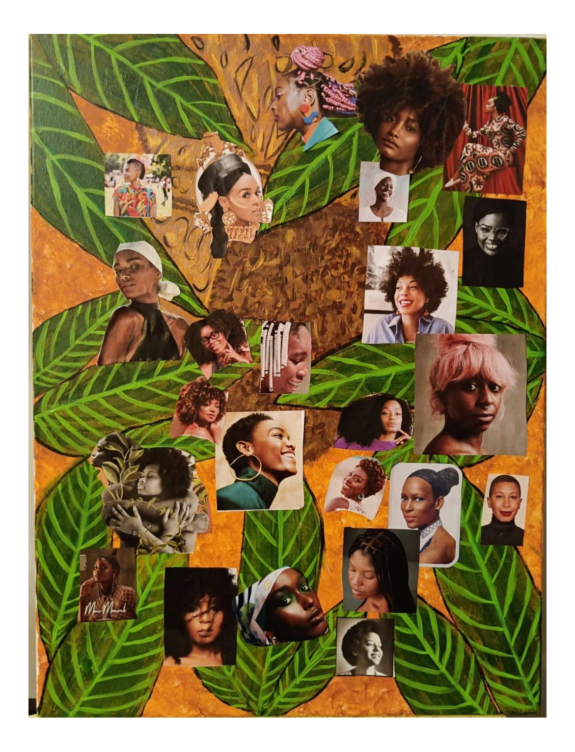
Figure 5: To All the Black Voices Who Came Before and Will Come After- Sometimes a Burden