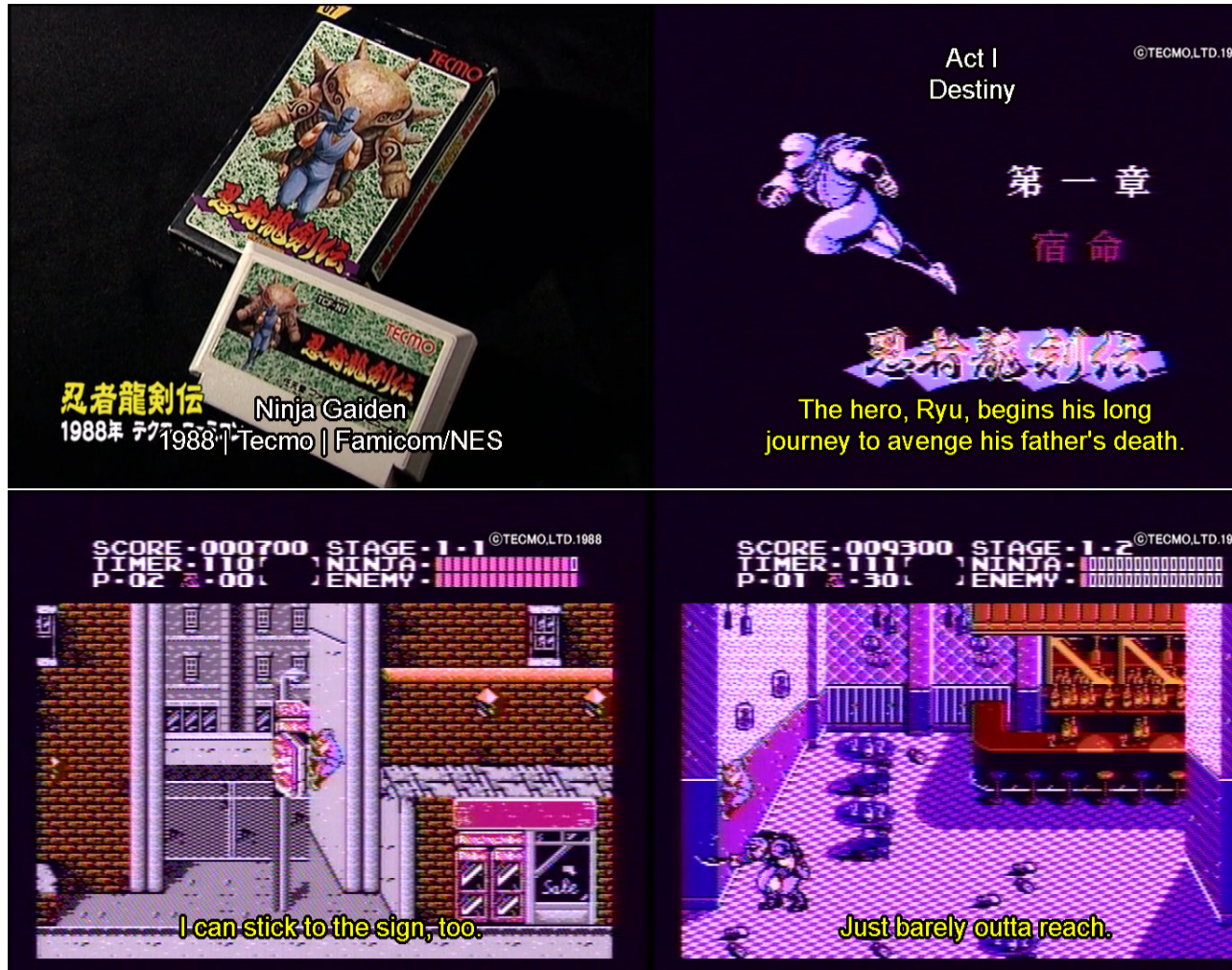
II. [4] first boss

Among challenges of season 4 was Ninja Gaiden for the Famicom, one of many ninja games but one of the best, described : “Even overseas, it has an enthusiastic fan base and it’s highly regarded as a masterpiece.”