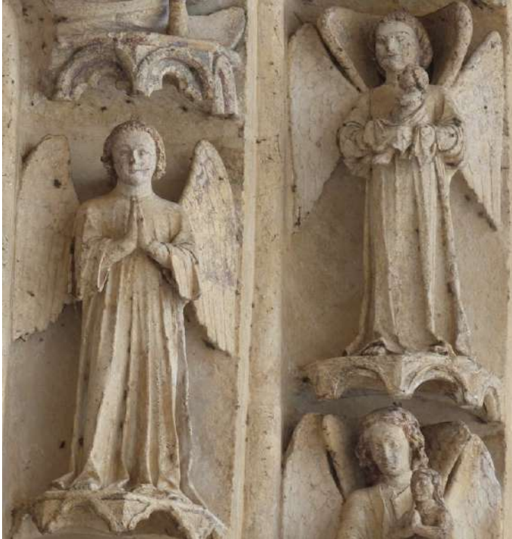
Fig. 7 Amiens Cathedral central doorway archivolt true left.

into four folds or so below the waist or knee and tracing zigzag breaks around the feet (Fig. 7).