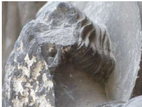
Fig. 12 Meaux Cathedral Trumeau St Stephen

Indeed, it is the masterly portraits of Church heroes on the right doorway of the South Transept of c. 1220, (SS Martin, Jerome and especially Gregory the Great), so outstanding in their level of detail and characterization that Sauerländer assigned them to a possible Sens workshop, which best show the same technique and style. One of the earliest instances of it is the remains of the back of the hair of the trumeau saint Stephen at Meaux cathedral (Fig. 12), the Paris Coronation portal prelate fragment of 1210-20 (Cl. 16602) is in the same vein, and it still persist as a type in the later northern French figure in the Schnütgen Museum 16 .