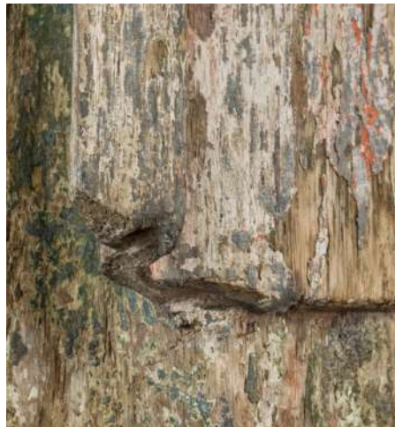
Fig. 5 Curve of cloak edge