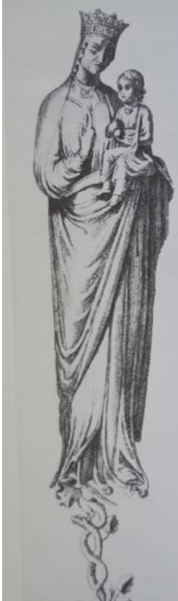
Fig. 2 sketch of trumeau Virgin by Dupuis

Alexandre Lenoir (Musée des Monuments Français, 1821). (Fig 2.)