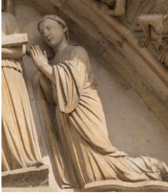
Fig. 11 Paris Cathédrale Notre Dame Central doorway St John