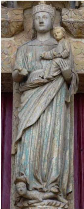
Fig. 3 Amiens Cathedral South doorway Trumeau

Villeneuve l'Archevêque (Yonne) (Fig. 4) given to no later than 1240 by Sauerländer. Though Sauerländer rightly saw the Amiens figure as directly inspired by the lost Paris one, Kasarska (2002) has shown that Longpont is even closer: their mantles drawn tight under the elbow, both Paris and Longpont still sport rectangular clasps, and crucially, the Child in each still wears the toga rather than tunic.