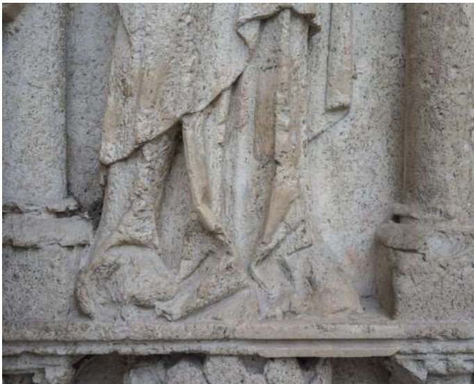
Fig. 10 Amiens Cathedral Central doorway right jamb wise virgin

There is consensus that the prototype for Notre Dame work, and also the central doorjamb virgins, was Sens (now mutilated), but what might the lost Paris ones have looked