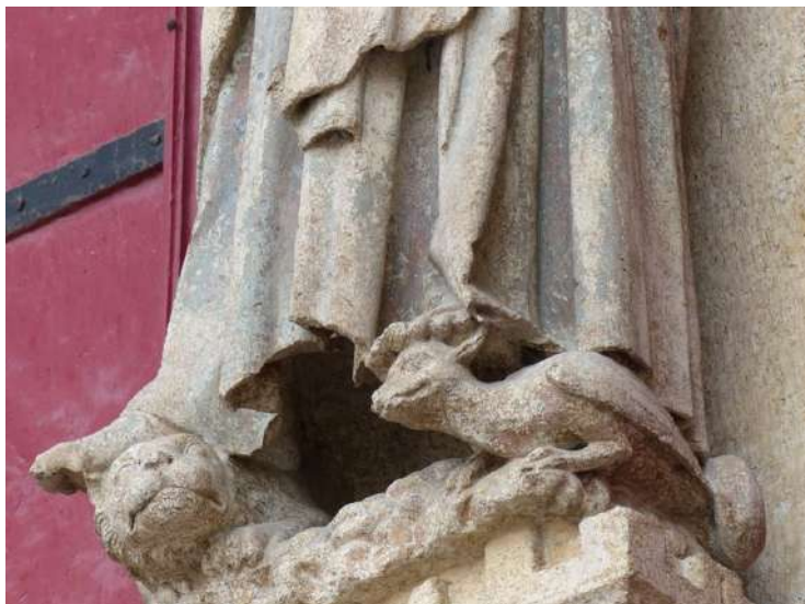
Fig. 1 Amiens Cathedral, central doorway, trumeau: Beau Dieu, polychromy.

the Beau Dieu at Amiens (Fig. 1) and on some figures of the Resurrection lintel fragment of Notre Dame Paris, now Musée du Moyen Age (CL. 18643 c), whereas the orange remains on the mantle and book are consistent with base layers used at the time, being a red-lead based paint. There are traces of what would have been important sections of gilding around the border of the cloak and the bottom of the tunic. The flesh tones are unlikely to be original despite containing lead white.