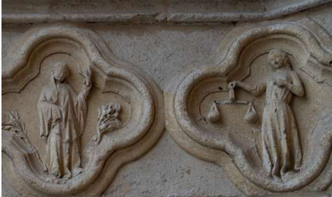
Fig. 9 Amiens Cathedral North doorway Libra and Virgo roundels