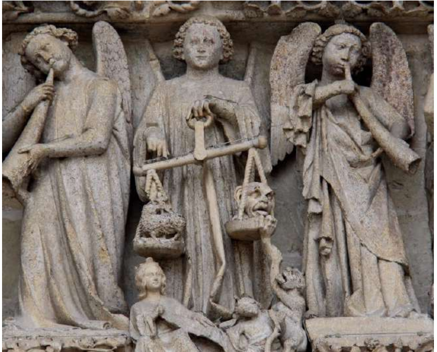
Fig. 8 Amiens Cathedral central doorway tympanum Michael

Firmin portal (Fig. 9). It is interesting that some of the greatest diversity in such folds is found on the central doorjamb depicting the wise and foolish virgins, which, given their structural position, must be reckoned some of the earliest work of the Amiens West facade (Fig. 10).