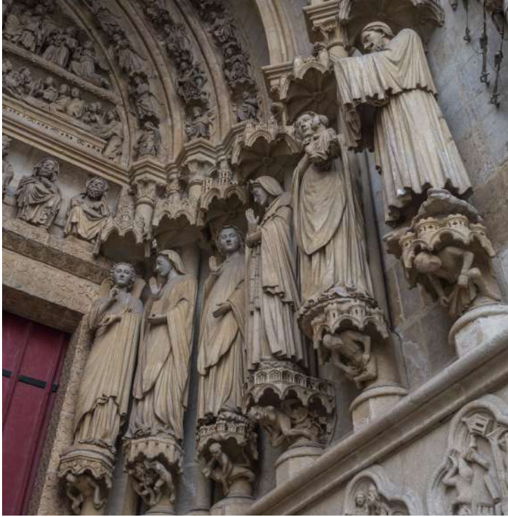
Fig. 6 Amiens Cathedral South doorway Annunciation, Visitation, Presentation.

Another contrast is that the virtues and vices roundels on the true left of the central jamb show more linear forms where those on the true right are broader and more crumpled. The same is true of the wise and foolish virgins on the centre doorpost. It is, however, precisely in this smaller-scale relief sculpture, including also on the trumeau base (God creating Eve), that, together with some of the angels of the two innermost archivolts, we find the closest equivalents to the crumpled folds of the present figure, the drapery bunching