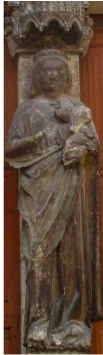
Fig. 4 Villeneuve l'Archevêque Trumeau Virgin and Child