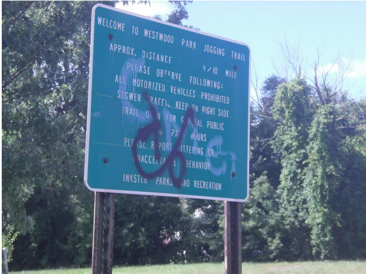
Figure 9. Vandalized sign in Westwood Park welcoming walkers to 0.4 mile trail around park perimeter in Summer 2014. Trail was in serviceable condition, but asphalt was beginning to buckle in places.