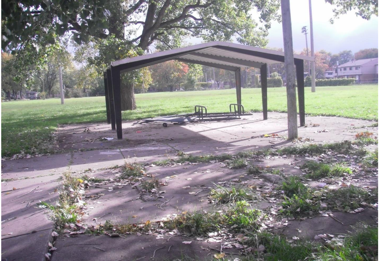
Figure 12. Vandalized picnic pavilion with upside down table and unknown other equipment on concrete floor at King Park in Summer 2014. Note light poles for unused ball diamond in background.