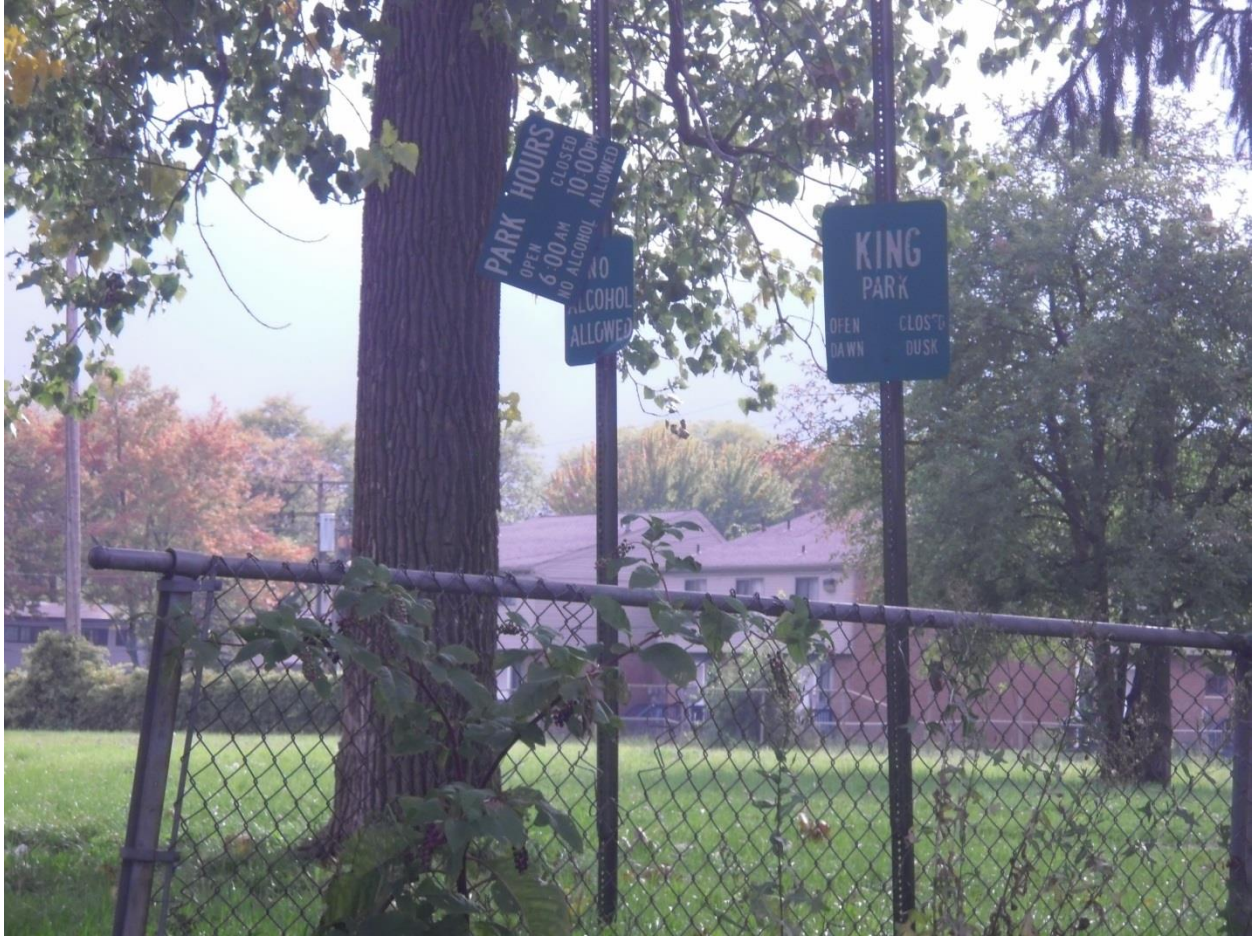
Figure 11. Signage at King falling into disrepute in Summer 2014. No LWCF acknowledgement sign found and all facilities in poor condition.