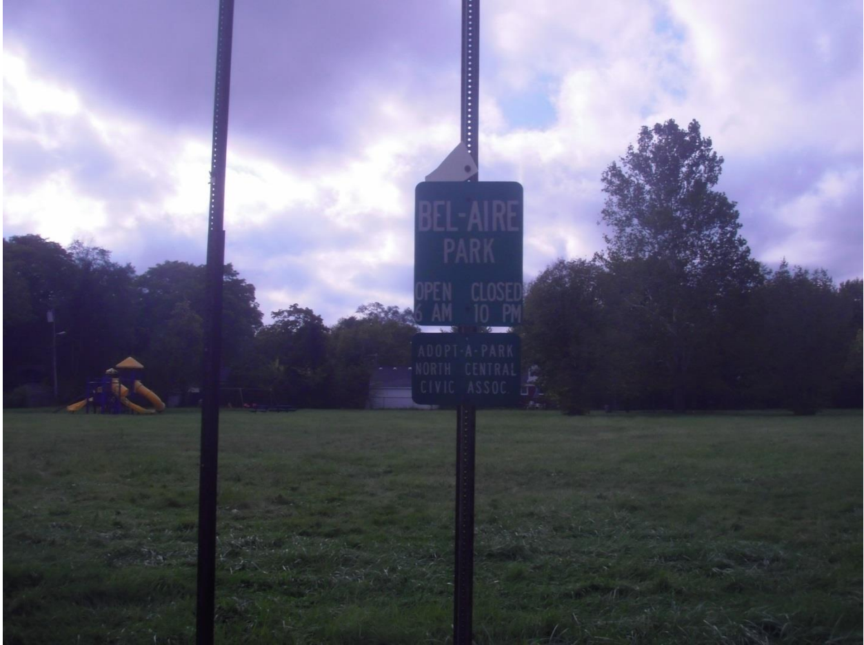
Figure 19. Sign for Bel Aire Park with playscape in background and adopt a park partner North Central Civic Association named, but actions not apparent.