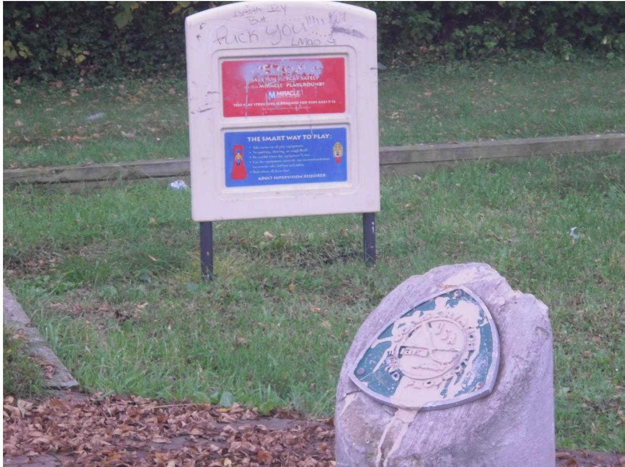
Figure 13. Vandalized grant recognition signs at Demby playground for both the Miracle Network that apparently sponsored the playground and LWCF. In addition the playground is in a depression that fills with water during rainy periods and is inaccessible to the disabled.