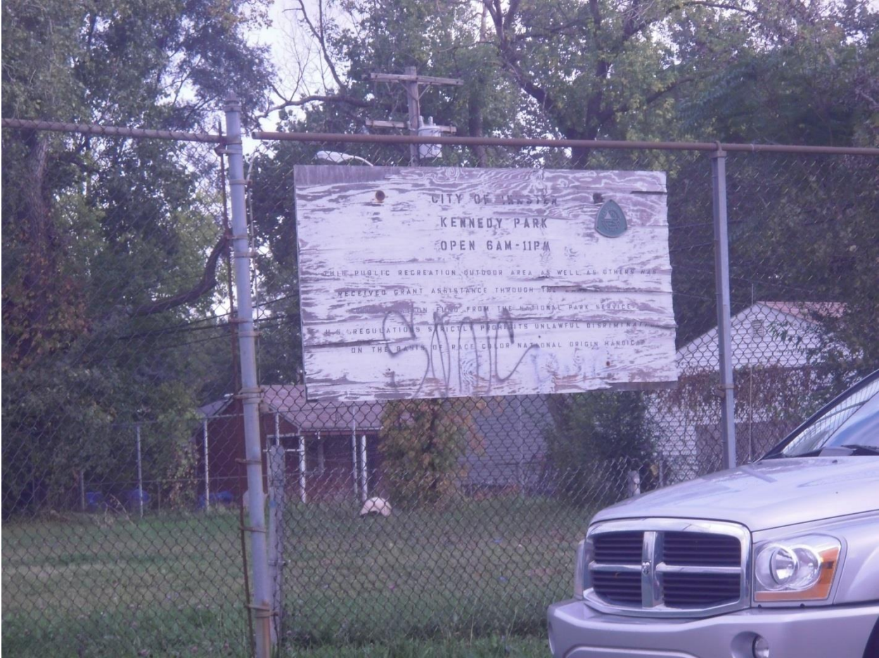
Figure 16. Disused ball diamond and vandalized, decrepit entry sign to Kennedy Park showing LWCF logo.