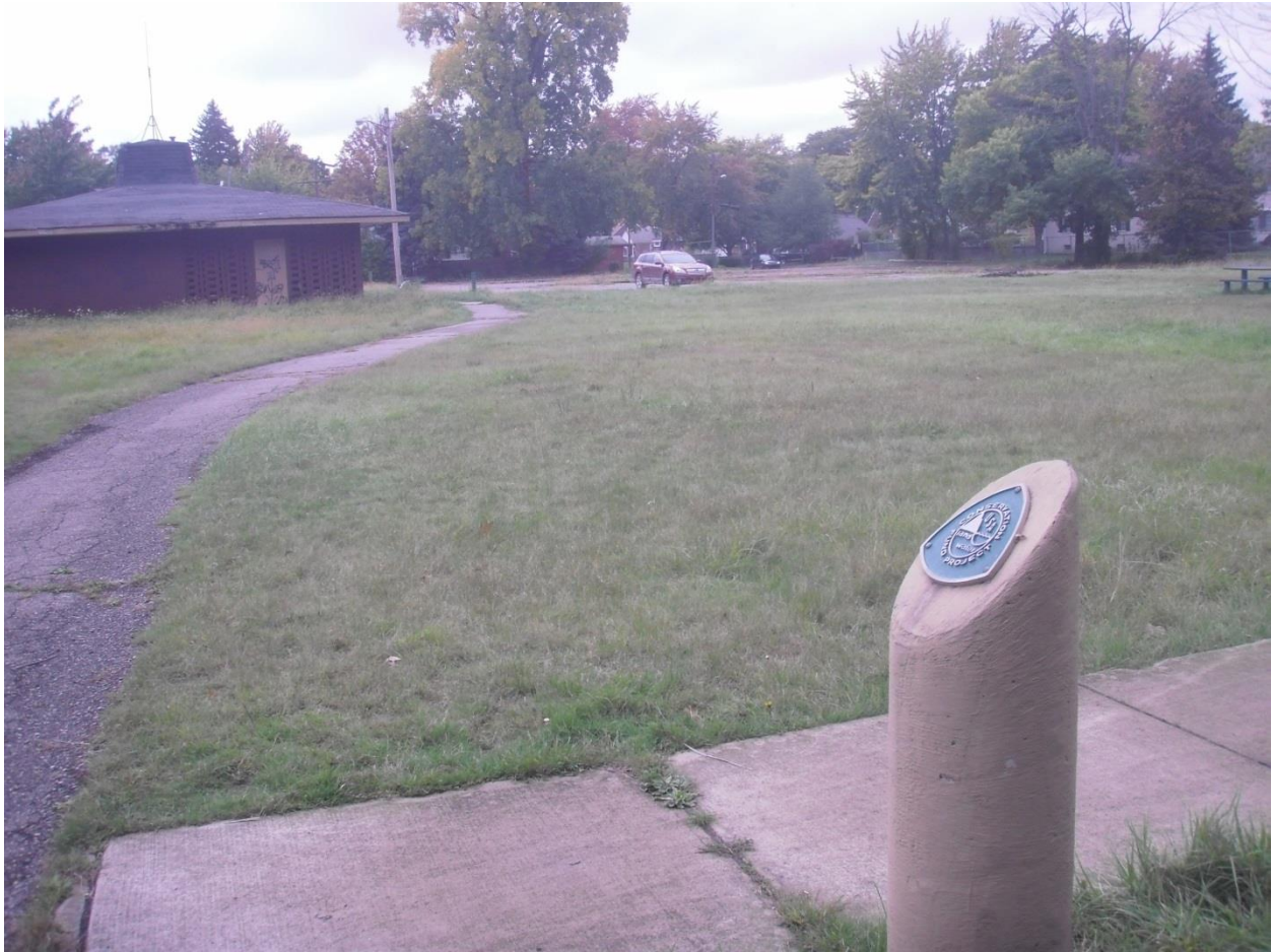
Figure 8. Westwood Park with LWCF logo on path to playground and vandalism on padlocked restroom facility near parking area Summer 2014.