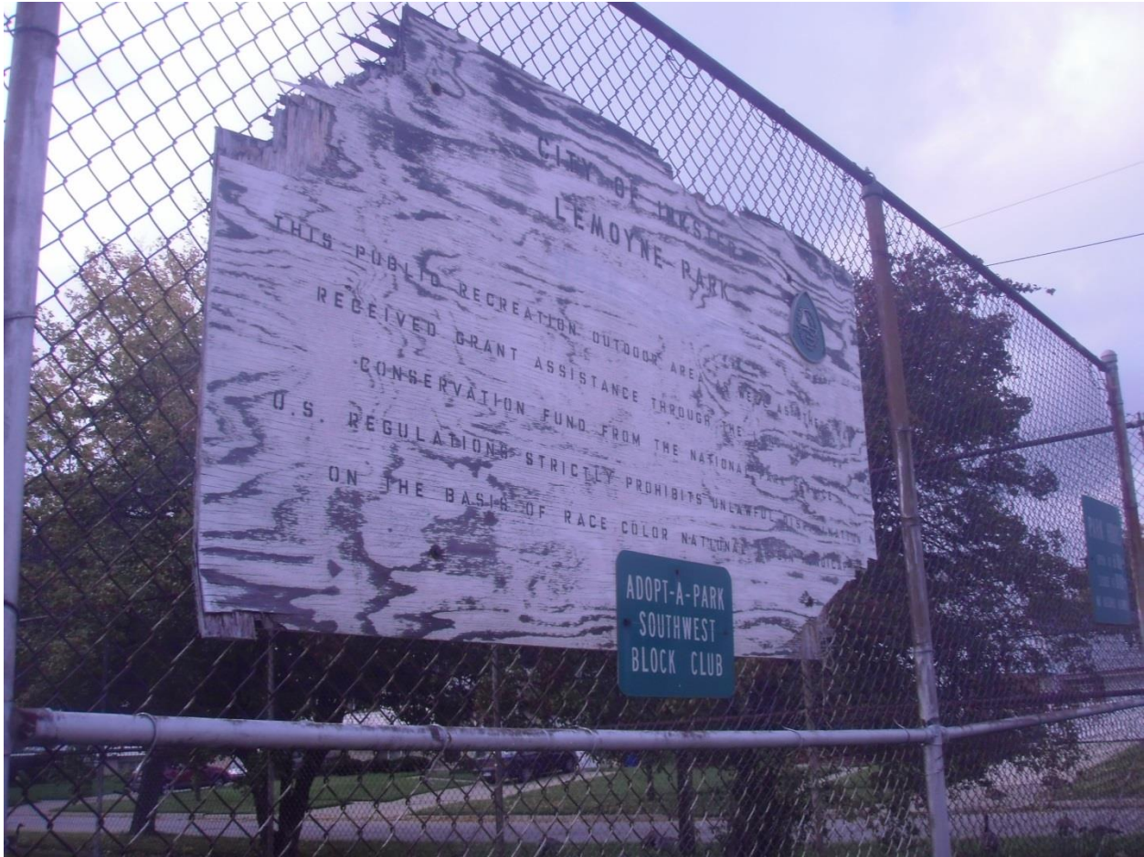
Figure 4 . Lemoyne Park sign with LWCF acknowledgement, adopt a park organization the Southwest Block Club listed and poor conditions in many aspects of the park including the sign.