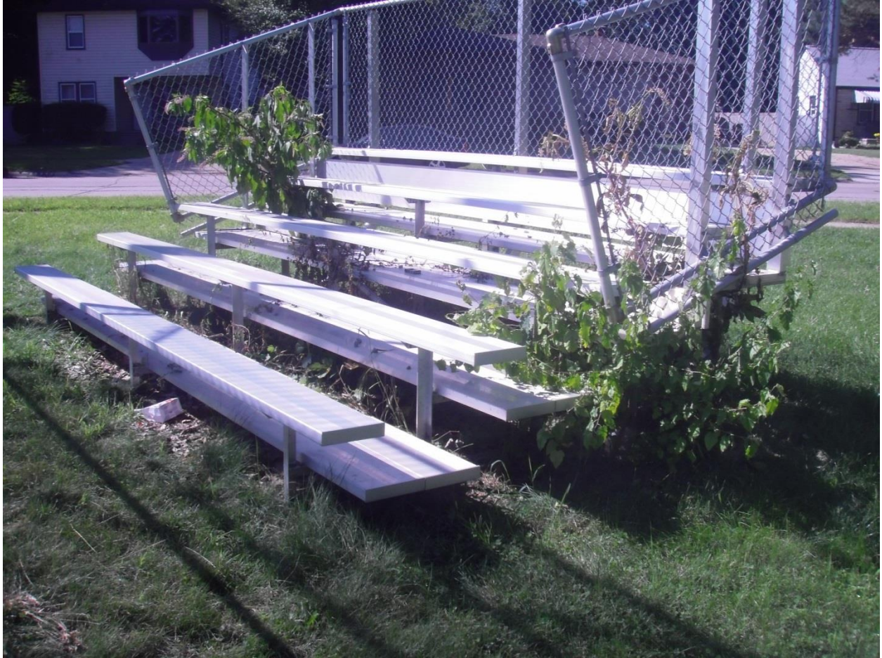
Figure 6 . Disused bleachers in Wheatley Park at ball field with trees protruding during summer 2014.