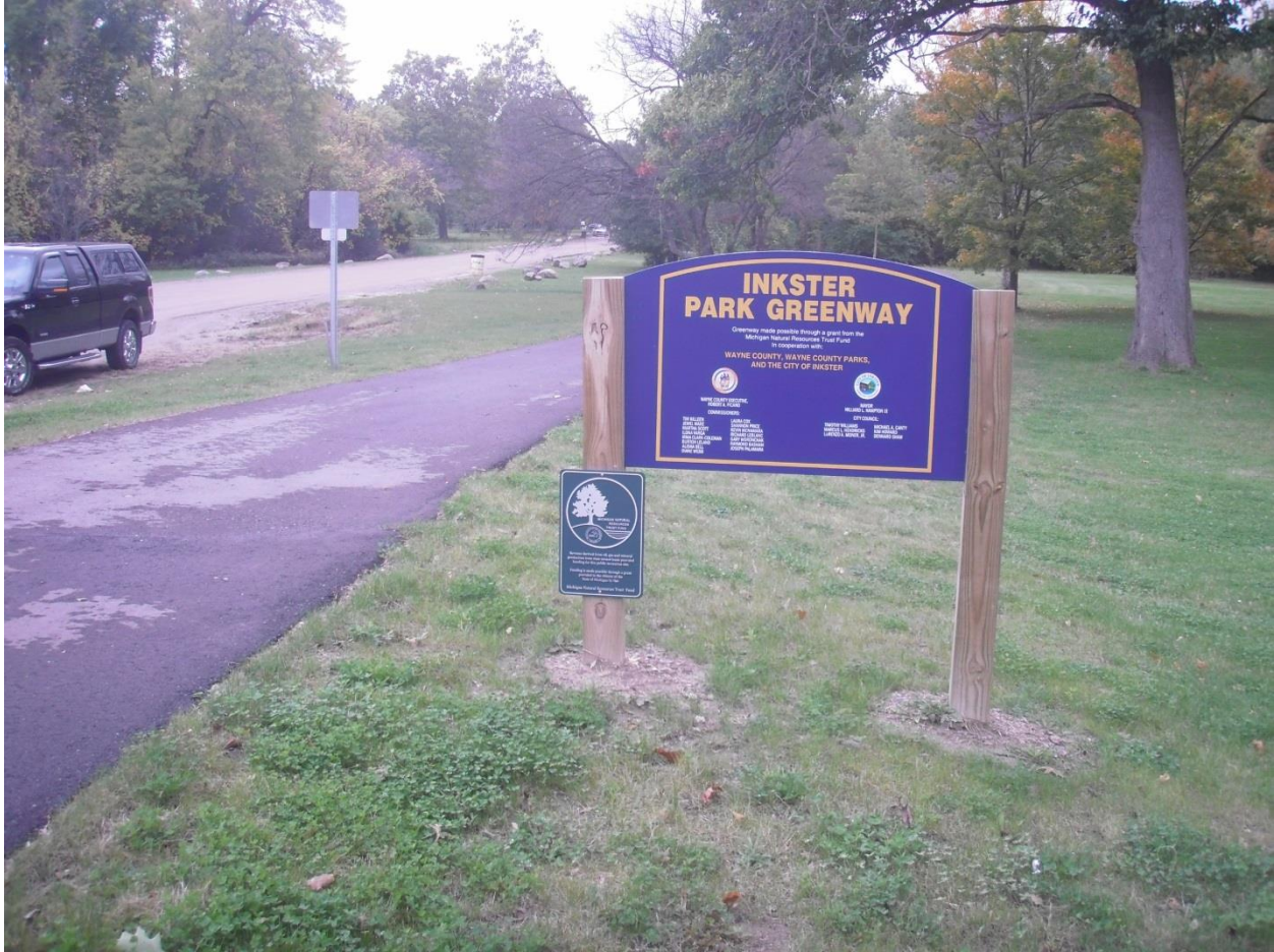
Figure 22. New Inkster Greenway Trail is in excellent condition with MNRTF recognition sign as it winds through Wayne County’s Inkster Park.