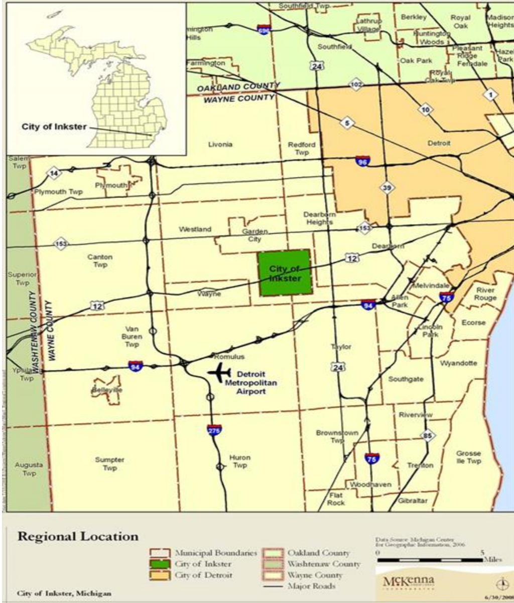
Figure 1. Locational map for City of Inkster.