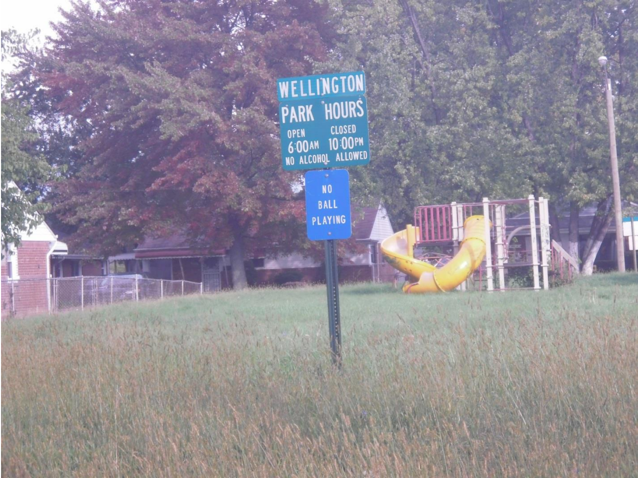
Figure 21. Knee high grass at Wellington Park and sign prohibiting ball playing with playscape in background with graffiti on underside of slide on left.