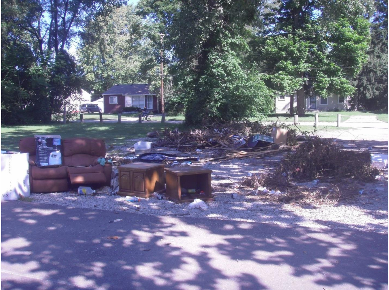
Figure 7. Trash dumping adjacent to Wheatley Park basketball courts in Summer 2014.