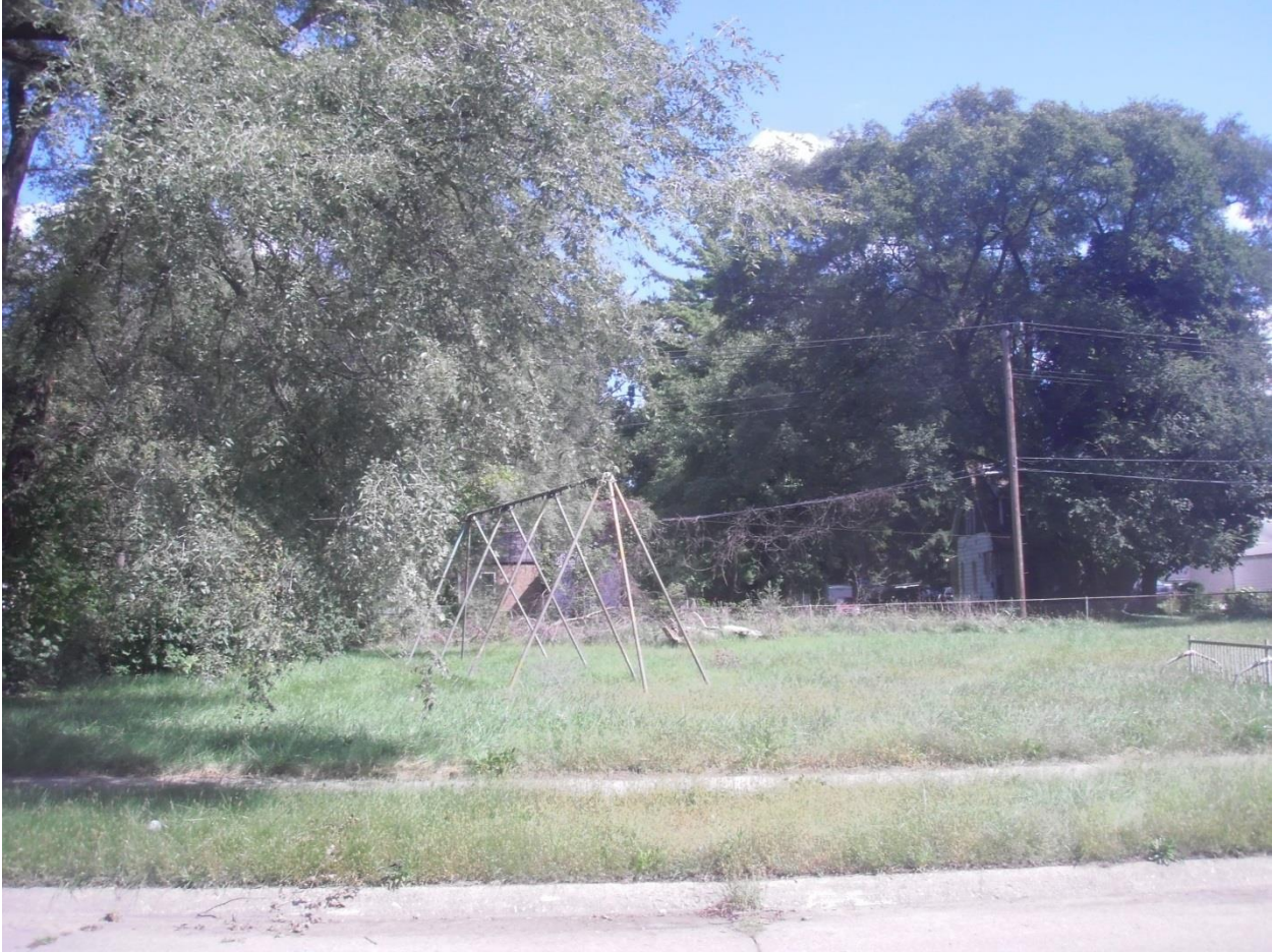
Figure 23. Moore Street Mini park overgrown in Summer 2014. Swing set is missing swings.