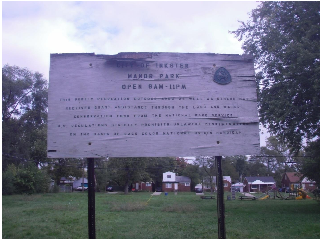
Figure 20. Manor Park sign with LWCF logo and playscape which is tagged with graffiti on underside of slide. Grass is approximately 12” high.