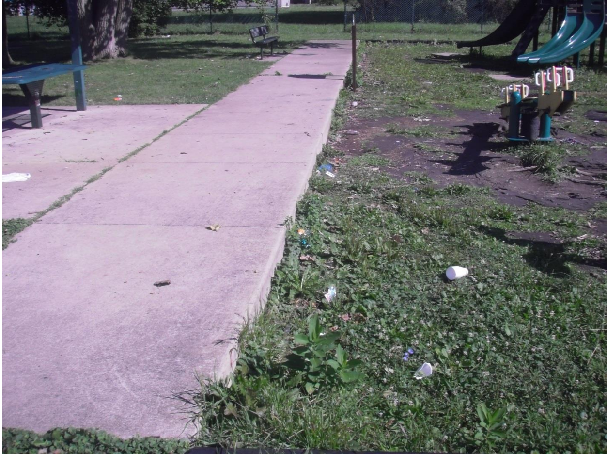
Figure 18. Inaccessible design for playground at Dartmouth with 4-6 inch dropoff to playground from sidewalk. In addition playground has litter, rolled filter fabric and lacks evidence of maintenance.