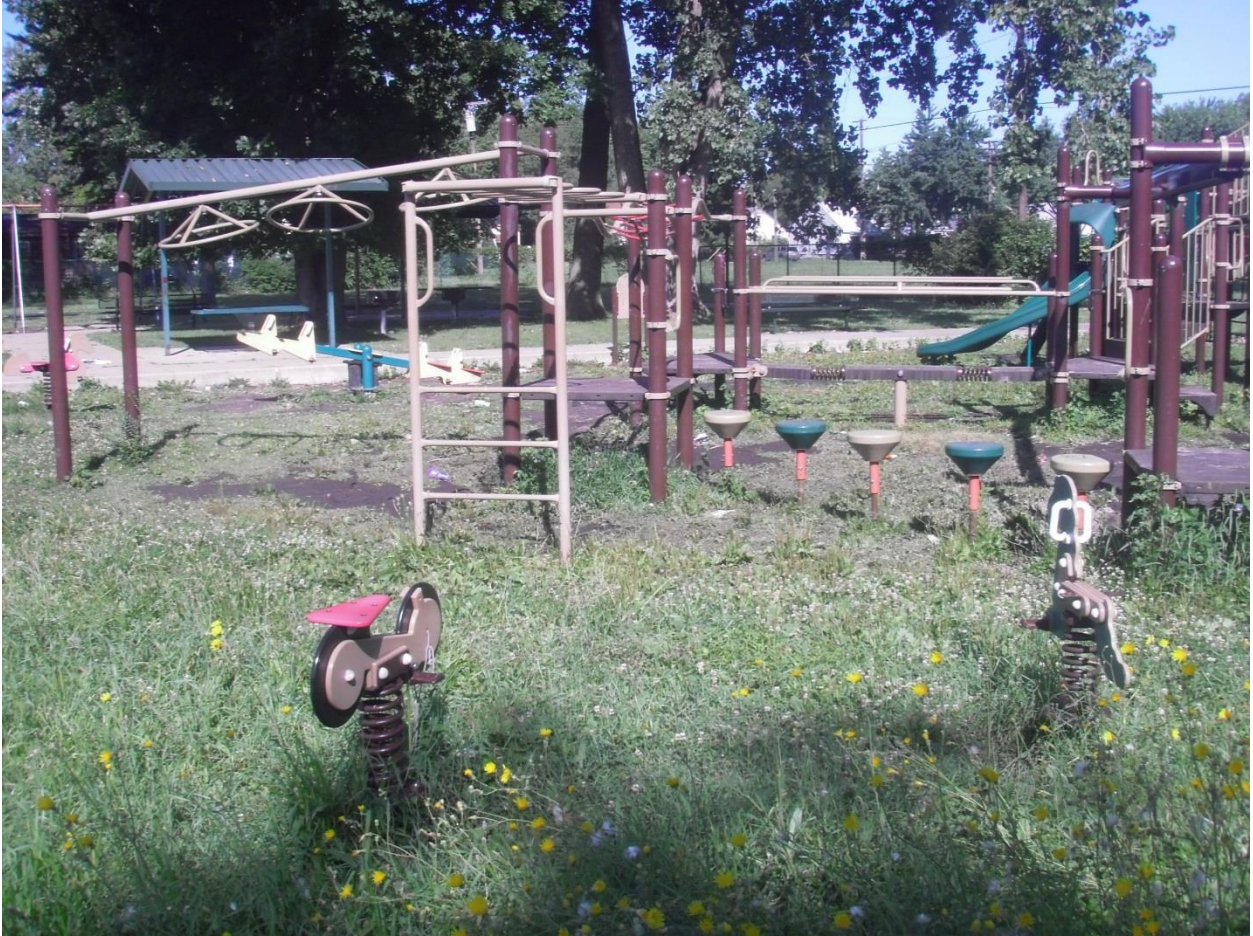
Figure 17. Overgrown playground at Dartmouth with newer playground equipment and a lack of maintenance.