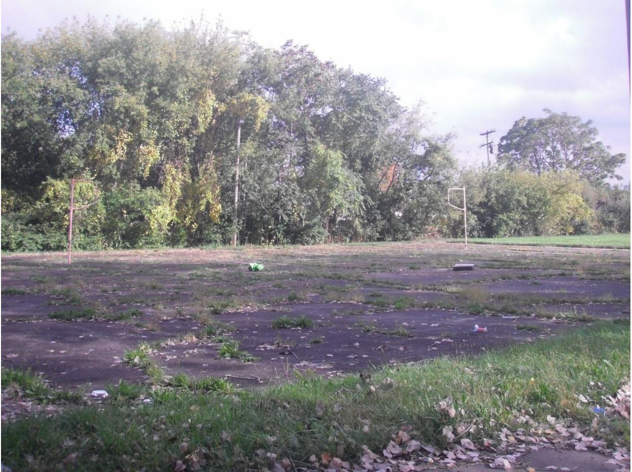
Figure 10 . Abandoned, obsolete basketball court at King Park in Summer 2014.