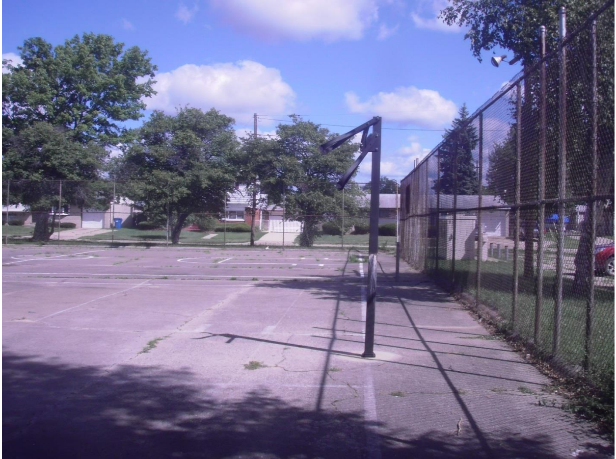
Figure 5 . Lomoyne former tennis courts reconditioned for basketball and then stripped of backboards and rims by vandals.