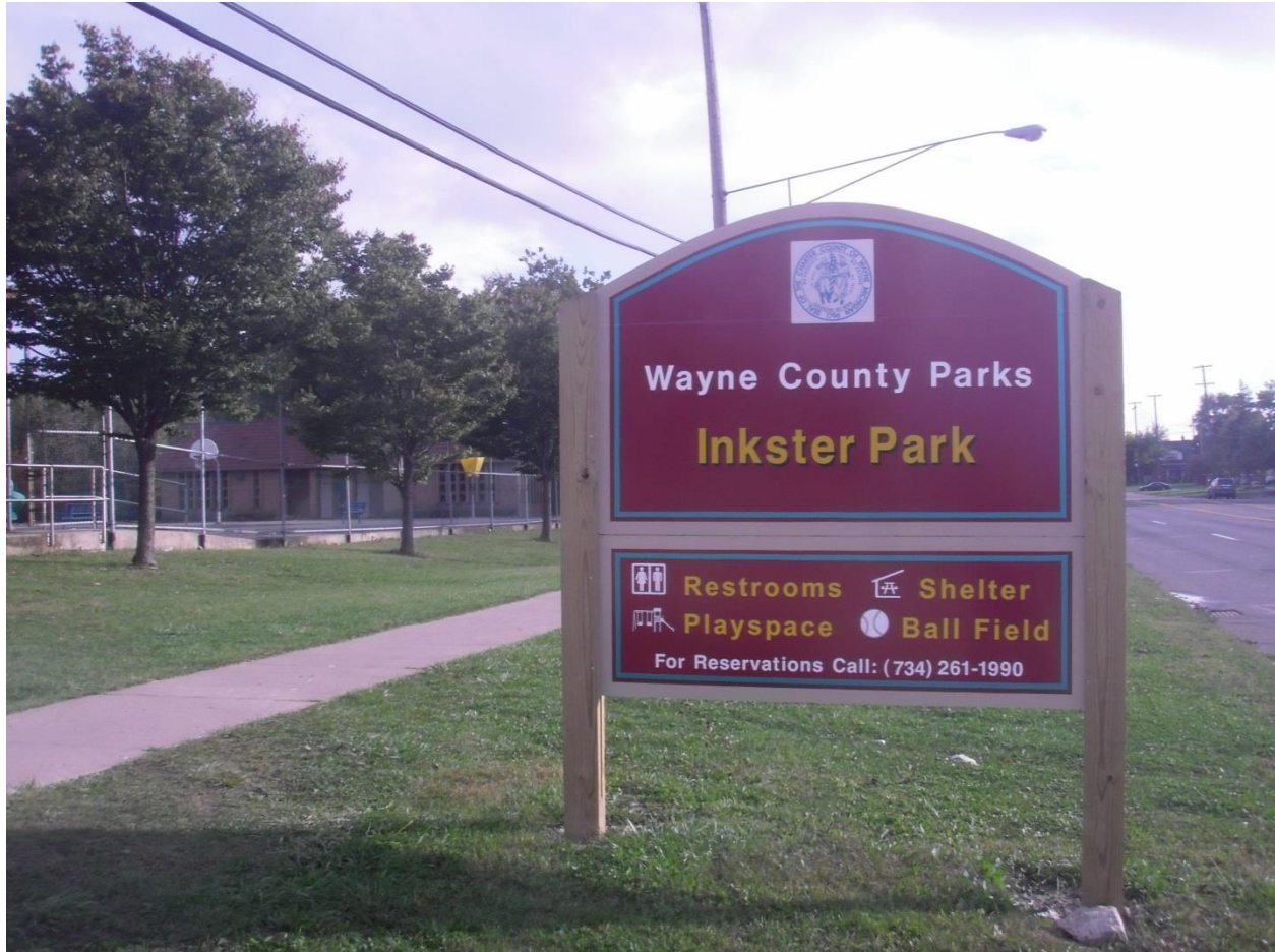
Figure 15. Wayne County Park sign at site of Inkster CSO, showing its management by Wayne County Parks.