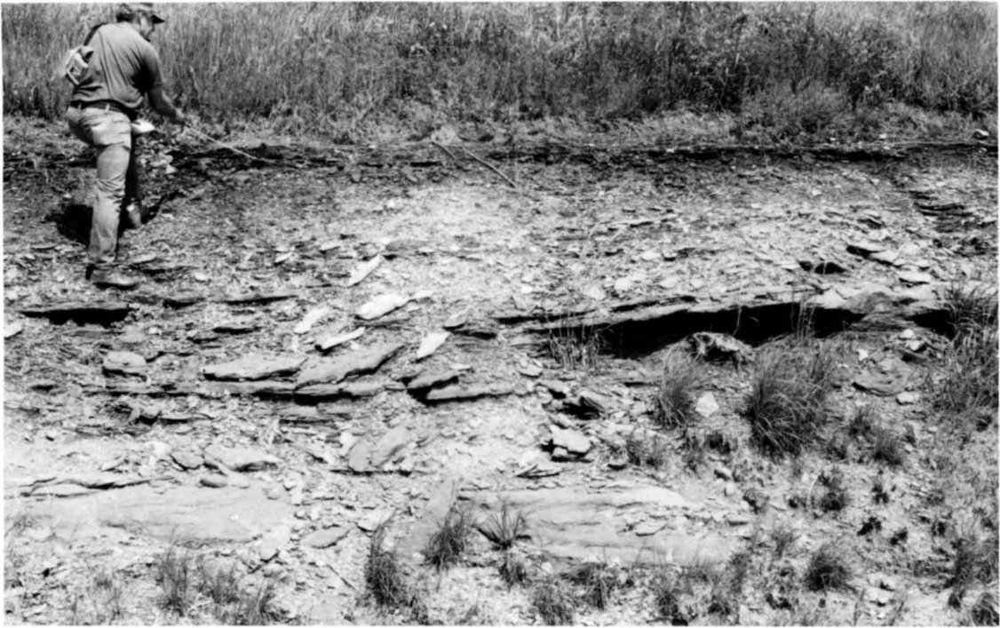
FIGURE 2—L. L. BRADY INDICATES THE BASE OF THE LORTON COAL BED AT ITS PRINCIPAL REFERENCE SECTION IN LYON COUNTY. Note the crossbedded sandstone (unit 1 in fig. 3) at the base of the exposure.