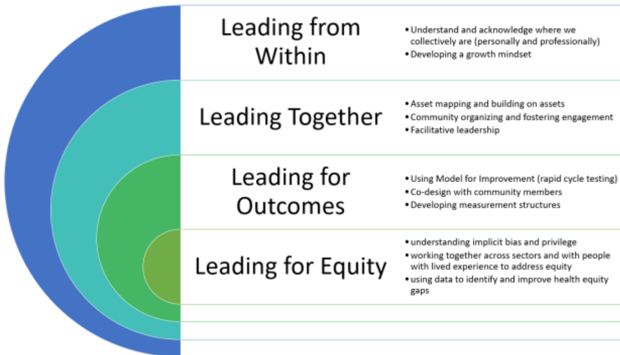
Figure 1: Elements of Leading for Abundance in SCALE

Cities Collaborative (Los Angeles, CA). We also describe how community psychologists contribute to the formative evaluation of the entire SCALE project based on the insights and experiences of the evaluators who are community psychologists. In each of the sample cases we discuss, we describe how key community psychology competencies are applicable across diverse settings in community health improvement work and how the competencies are used to promote equity in communities of color.