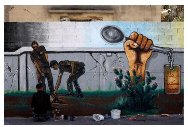
Image 3: An artist in Gaza City works on a mural glorifying six Palestinian prisoners who escaped from Israel's Gilboa prison. This is a continuous struggle. Our struggle is a metaphysical resistance and this image is the actual physical