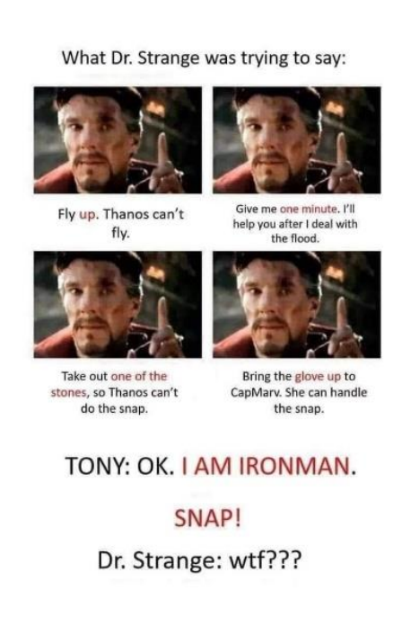
Figure 2: Meme about the many possible meanings of Doctor Strange's gesture displaying the confusion about the logic of Tony's interpretation of the same.

over the universe's would never interpret a gesture as an indicator that he had to give his life, especially after he managed to build a family and heal his own wounds as a parent, many claimed. The gesture that detonated Tony's ultimate sacrifice could have meant a million things, exemplified by the following meme by Reddit user u/tisisneo :