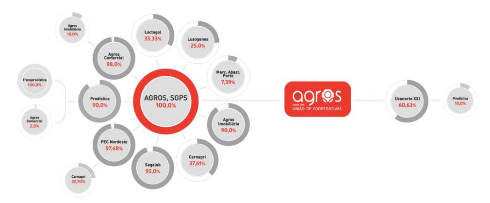
Figure. 3. Agros Group.

Agros Group - <a href="http://www.agros.pt/a-agros#grupo-agros">http://www.agros.pt/a-agros#grupo-agros</a>