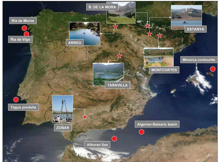
Figure 1: Satellite image of the Iberian Peninsula region with the location of lake records (stars) and marine sites (dots) discussed in the text.

Most of the studied lakes (e.g., Estanya, Taravilla, Zoñar, Arreo and Montcortés) record relatively shallower lake levels and more arid conditions during the MCA. This is indicated by higher chemical concentrations in the water, and the predominance of sclerophyllous Mediterranean vegetation, heliophytes and more evergreen trees in