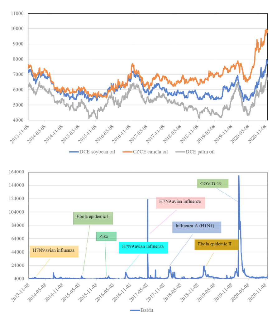
Figure 1. Time series plots of China's edible vegetable oil futures prices and Baidu index.

proxy and the searching area is limited within mainland China with both PC and mobile device terminals. The data sample are collected through 10 November, 2013 to 27 November, 2020, totally 1720 daily observations for each variable.