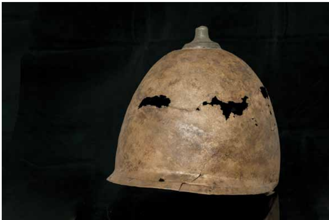
Fig. 3. Helmet from Sisak / Sl. 3. Kaciga iz Siska