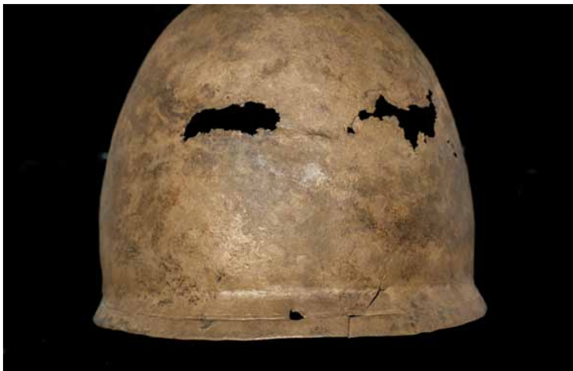
Fig. 7. Helmet from Sisak / Sl. 7. Kaciga iz Siska

While its shape – i.e a rounded conical bowl terminating at the top with what might be described as a crest-knob, a slightly thickened rim at the base of the bowl, drawn out at the rear to form a small sloping and projecting neck-guard – unquestionably resembles the helmets of the Etruscan-Italic type 3 (also known as the Montefortino type according to Robinson 4 , Paddock 5 and Junkelmann 6 , or as conical helmets with a crest knob 7 ), it differs from those in several rather significant details. For instance, the rim at the base of the bowl forming the small neck-guard does not appear to have been decorated, except for two incised parallel lines encircling the rim. This is rather unusual, punched patterns being apparently the norm on later specimens of the Etruscan-Italic helmets. 8 Even more significantly, the decorative fitting on the top was not cast together in one piece with the helmet (as usual with helmets of that type), but was subsequently soldered to it. This detail may tempt us to consider that it could have been a Celtic bronze helmet, of the type manufactured in northern Italy during the La Tène B and C periods, subsequently used as a model for the Etruscan-Italian helmets. 9 However, the crest knobs of Celtic bronze helmets were riveted, which does not appear to be the case with this specimen from Sisak. 10 In addition, the fact that finds of similarly shaped