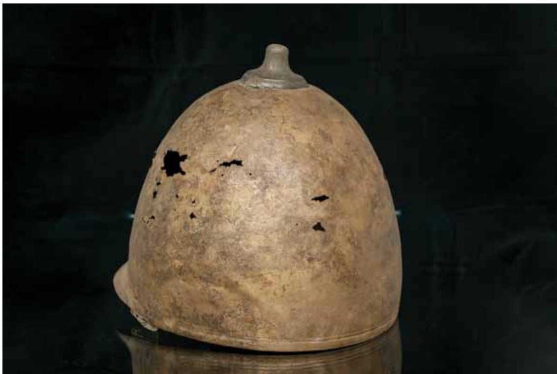
Fig. 5. Helmet from Sisak / Sl. 5. Kaciga iz Siska