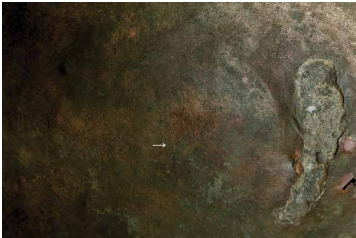
Fig. 11. Possible traces of an inscription inside the helmet (photo: Igor Krajcar) / Sl. 11. Mogući tragovi natpisa unutar kacige (foto: Igor Krajcar)

2 nd and the early 1 st century B.C. than of the earlier Celtic helmets. 14 It should be pointed out that one may perhaps discern traces of an inscription executed in pointillé work situated near the interior apex ( Fig. 11 ). It might have been an owner's mark, but the spot is rather unusual since linings were most likely glued into the helmets of this type: if this really is an inscription, it should rather be interpreted as a maker's mark. 15