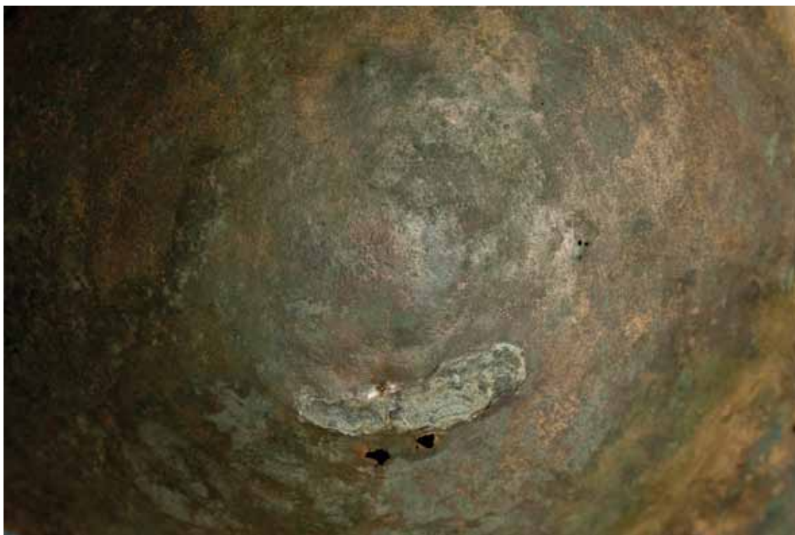
Fig. 10. Traces of lead around the base of the decorative fitting / Sl. 10. Tragovi olova ispod ukrasnog nastavka

It should be mentioned that we know of Roman helmets with a decorative fitting that was subsequently soldered to the dome, dated to the beginning and the first half of the 1 st century B.C. 12 However, in spite of this simplified production method, their decorative fittings do not look different in the least from the usual conical form. Interestingly, the Sisak helmet fitting is of a rather crude manufacture, as if it were a later add-on, seemingly a makeshift repair, perhaps done in the field, conceivably by the owner of the helmet himself and not an original part of the helmet, fashioned within the manufacturing process in the production facilities. Presumably, the original crest knob was broken and replaced by this clumsy fitting. The restoration process showed that this fitting had been soldered, 13 and traces of lead (and presumably tin) are clearly discernible around the base of the decorative fitting ( Fig. 10 ).