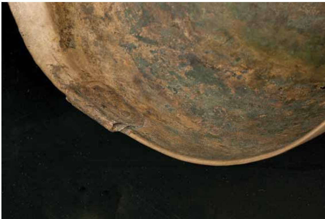
Fig. 12. Traces of spinning / Sl. 12. Tragovi izrade na rotirajućem kalupu na kolu