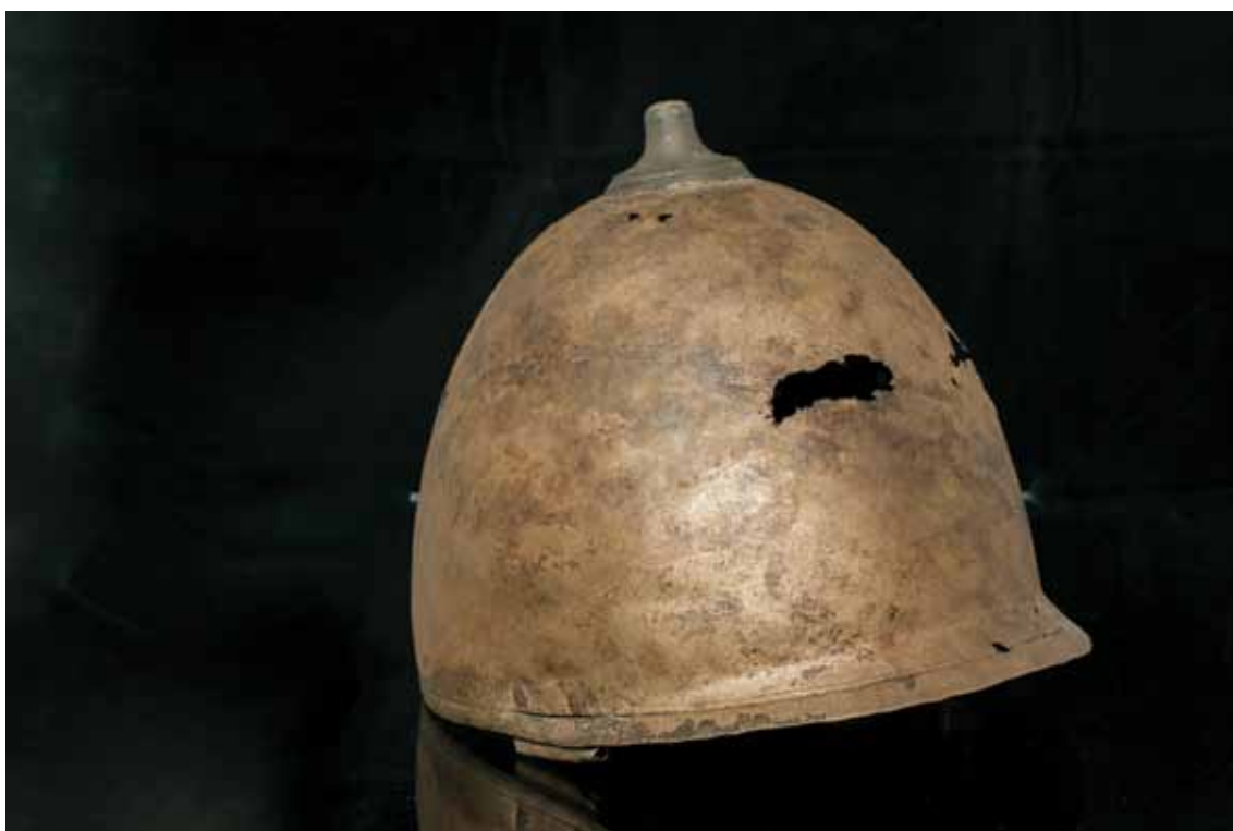
Fig. 2. Helmet from Sisak / Sl. 2. Kaciga iz Siska