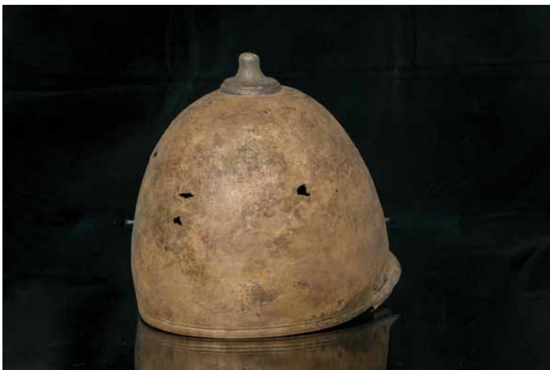
Fig. 6. Helmet from Sisak / Sl. 6. Kaciga iz Siska