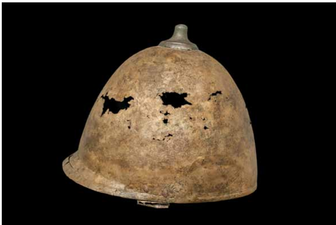
Fig. 4. Helmet from Sisak / Sl. 4. Kaciga iz Siska