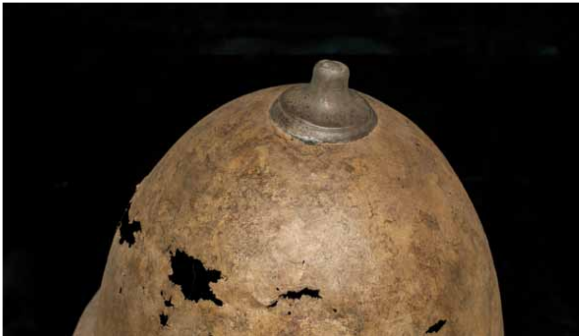
Fig. 8. Decorative fitting of the helmet / Sl. 8. Ukrasni nastavak kacige

Celtic bronze helmets are mostly limited to the territory of Northern Italy and the western Alps 11 would not speak in favour of Celtic attribution of our specimen. The campaniform decorative fitting itself finds no parallels with either the Celtic or Italian specimens, which adds another difficulty to the analysis of this helmet ( Figs. 8–9 ).