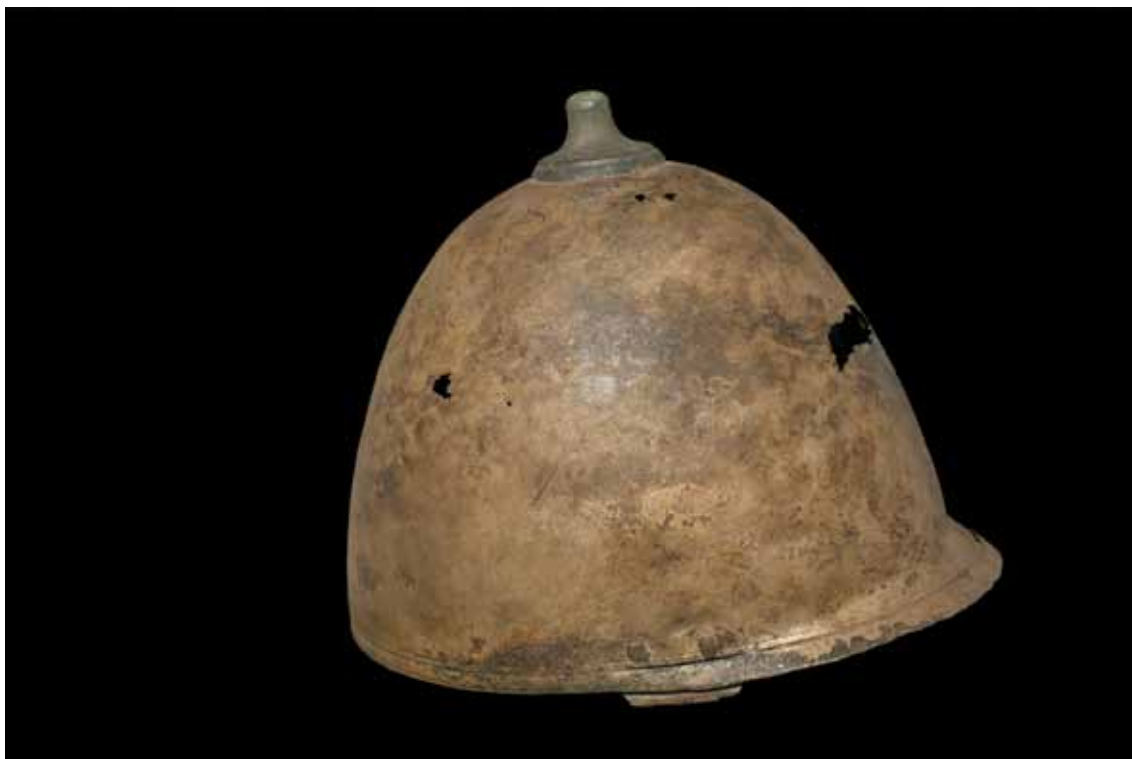
Fig. 1. Helmet from Sisak / Sl. 1. Kaciga iz Siska