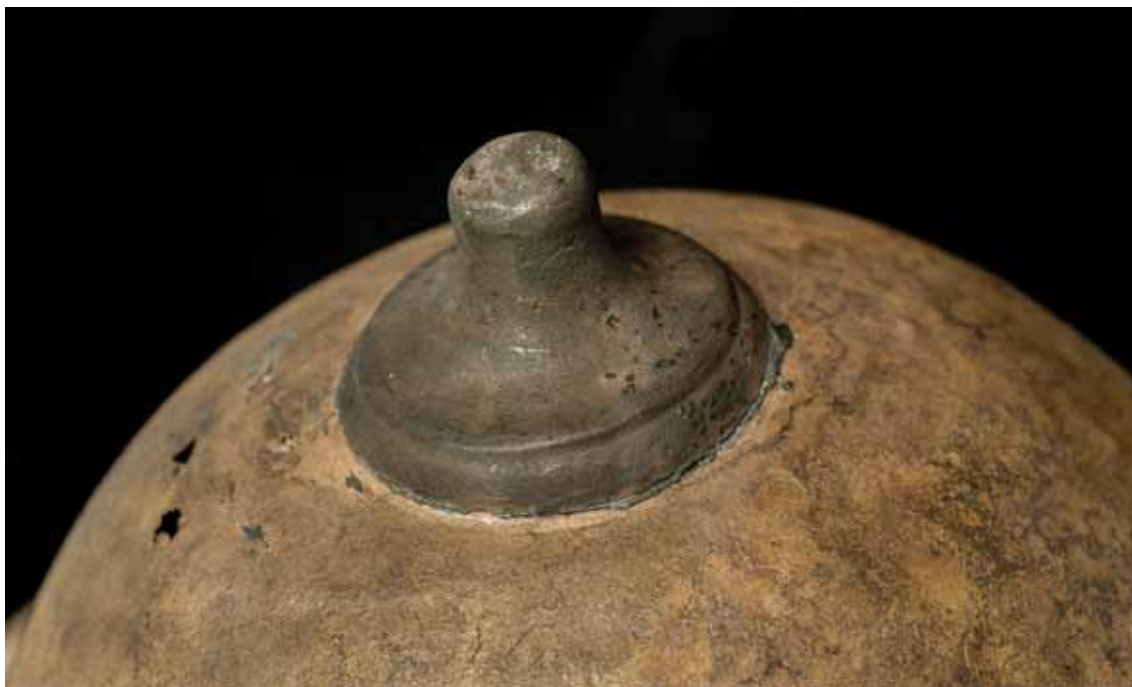
Fig. 9. Decorative fitting of the helmet / Sl. 9. Ukrasni nastavak kacige