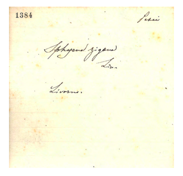
Fig. 2. Historical inventory card of the liquid-preserved Leghorn specimen mentioned by Borri (1934) and assigned therein to Sphyrna zygaena ; that specimen is the same as P73, which is identified herein as belonging to Sphyrna tudes (as per Tortonese, 1950, 1951, Carnevale et al. , 2007 and Serena et al. 2020).