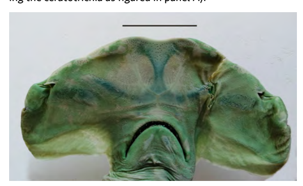
Fig. 4. Ventral view of the head of the liquid-preserved Sphyrna tudes specimen P73. The scale bar equals 5 cm.

can be described in the following terms. Expanded prebranchial head hammer-shaped and very wide but longitudinally fairly long, its width 29.9% of total length (145 mm / 485 mm); distance from tip of snout to rear insertions of posterior margins of expanded blades 45.5% of head width (66 mm / 145 mm); anterior margin of head broadly arched, with prominent medial and lateral indentations; posterior margins of head wide, transverse, and broader than mouth width; well-developed prenarial grooves present anteromedial to nostrils: preoral snout 29.6% of head width; rear ends of eyes slightly anterior to upper symphysis of mouth; mouth rather narrowly arched; anterior teeth with moderately long, slender, smooth cusps, posterior teeth cuspidate and not keeled and molariform. First dorsal slightly falcate, its origin slightly behind pectoral insertions, its free rear tip about over pelvic origins; second dorsal fin fairly high, less than anal height, with a moderately concave posterior margin; its inner margin moderately long, but less than twice fin height (24 mm versus 17