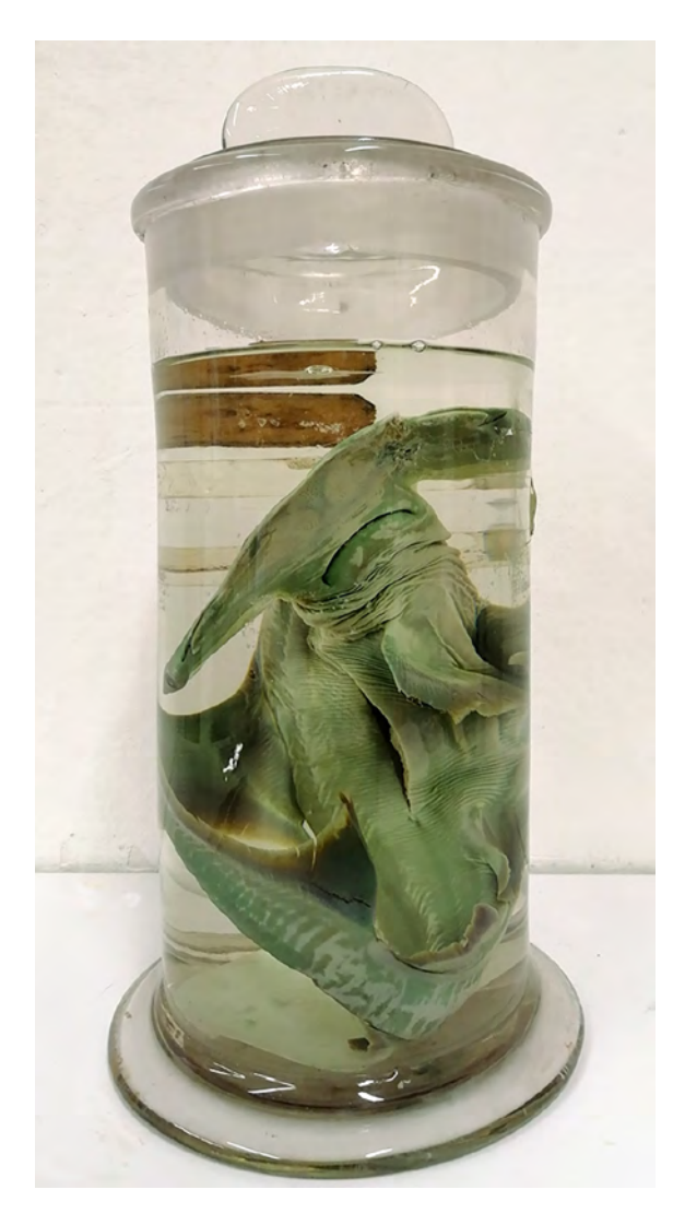
Fig. 1. The liquid-preserved specimen of Sphyrna tudes in the zoological collection of the Natural History Museum of the University of Pisa (P73).

The recent study by Pollom et al. (2020), according to which the Leghorn specimen of Sphyrna tudes rather represents Sphyrna lewini , acted as the catalyst for measuring and redescribing this purported smalleye hammerhead specimen (preserved at the NHMUP with inventory number P73), as well as for reappraising its taxonomic affinities. Our updated taxonomic identification of P73 (Fig. 1) was based on the diagnostic keys and features reported by Compagno (1984) and