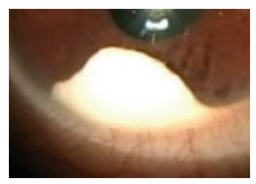
Fig. 2. Triamcinolone pseudohypopyon.

After intravitreal injection of TA, trabecular outflow obstruction can occur due to the accumulation of crystalline steroid particles in the trabecular meshwork<sup>18</sup>. Following intravitreal injection of triamcinolone, dissolution of insoluble triamcinolone crystals into soluble triamcinolone within the vitreous occurs. One part of the drug targets the retina, but a larger portion diffuses anteriorly to the crystalline lens and outflow pathways. In our study, in one eye, in the early post injection period, greater accumulation of crystalline particles occurred in the anterior chamber of the eye in the form of a transient 'triamcinolone pseudohypopyon', but surprisingly without a significant IOP increase (Fig. 2).