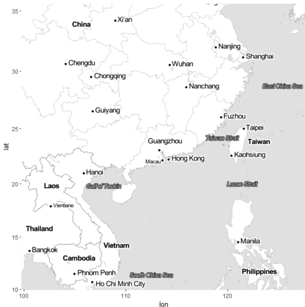
Figure 2. Time Trend of Annual Electricity Consumption in Guangzhou (1949–2016). Source: Stata and R software.

Note: 1) Megawatt Hours is the unit measuring electricity consumption (E); 2) Yuan is the unit for measuring income (Y). Source: Stata and R software.