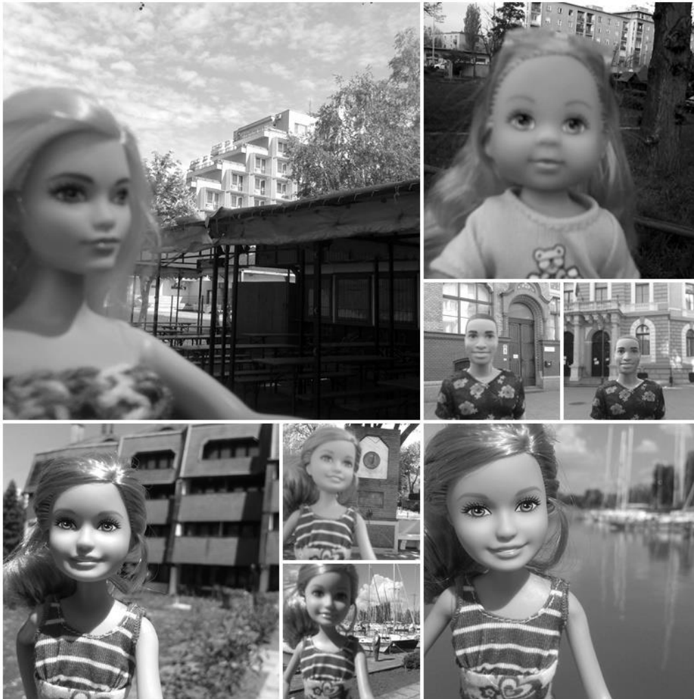
Figure 2. Mix of pictures from the game, based on [19].

A multi-round online game has been created to model the additional information: Guess where the doll is! In a given round, photos were taken as if a toy doll had taken selfies in a particular location. It was up to the players to guess the location using the additional information in the background. The surprising result of the game was that the players could not only decode the information that the organizer was thinking. Players were also able to decode additional information about the doll's manufacturer and clothing [19]. A mix of images from the game is shown in Figure 2.