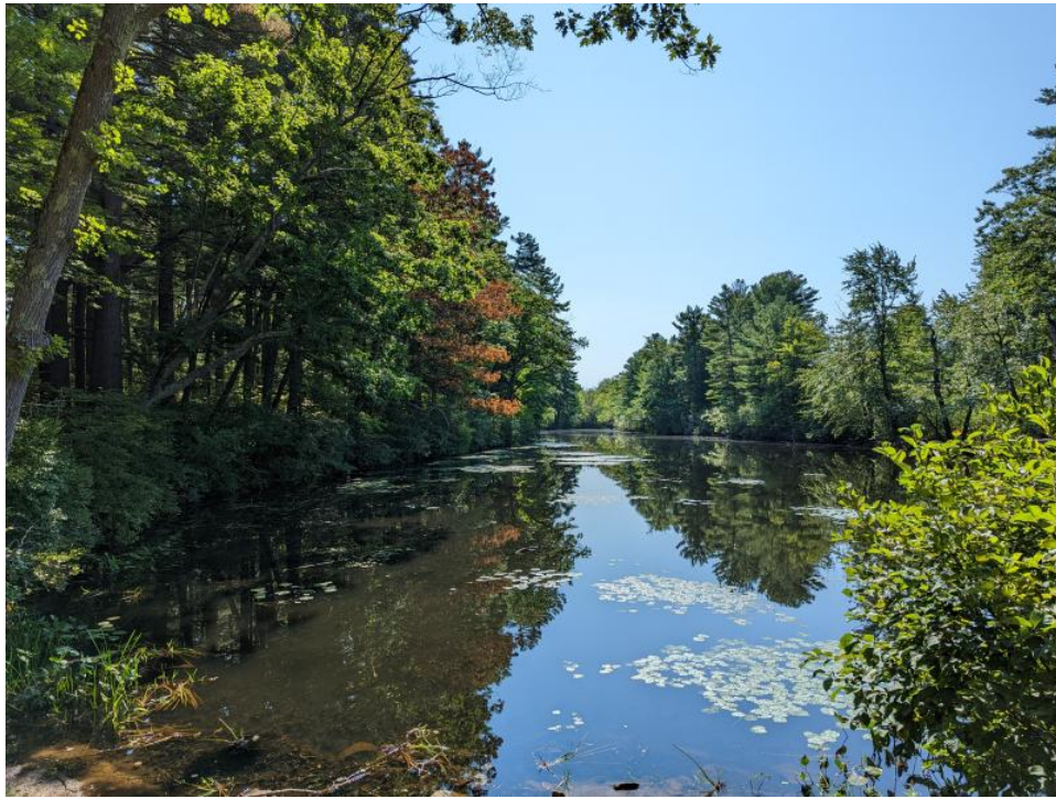
View of Cocheco River from below the walking bridge.