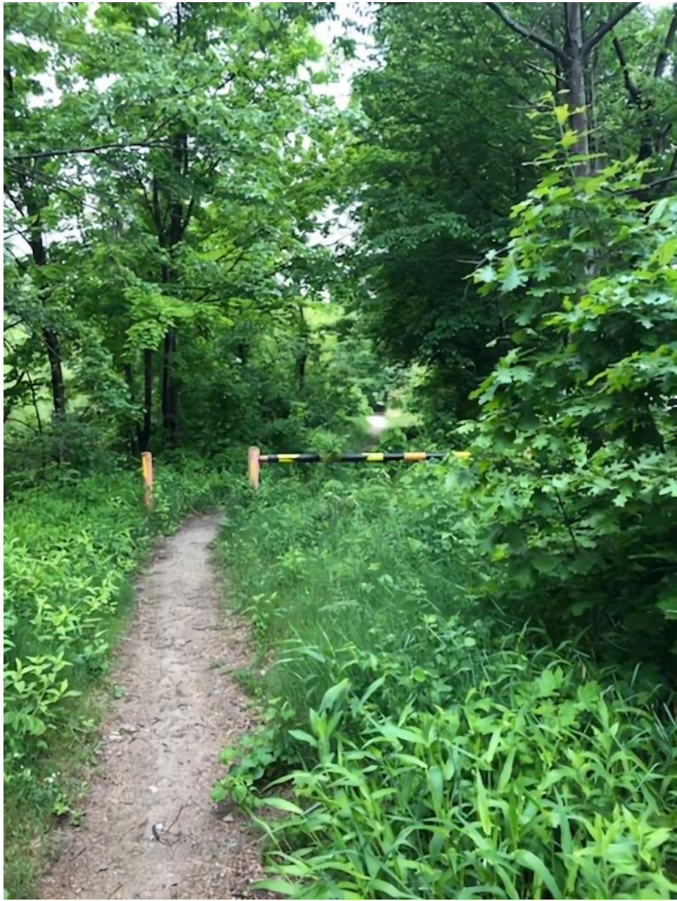
Walking path entrance to rail trail.