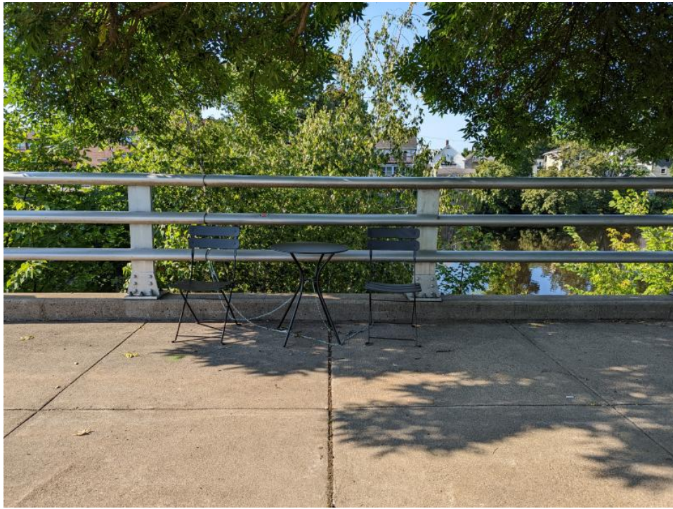
Chairs and table along Cocheco River providing a perfect place to enjoy the natural beauty or have lunch.