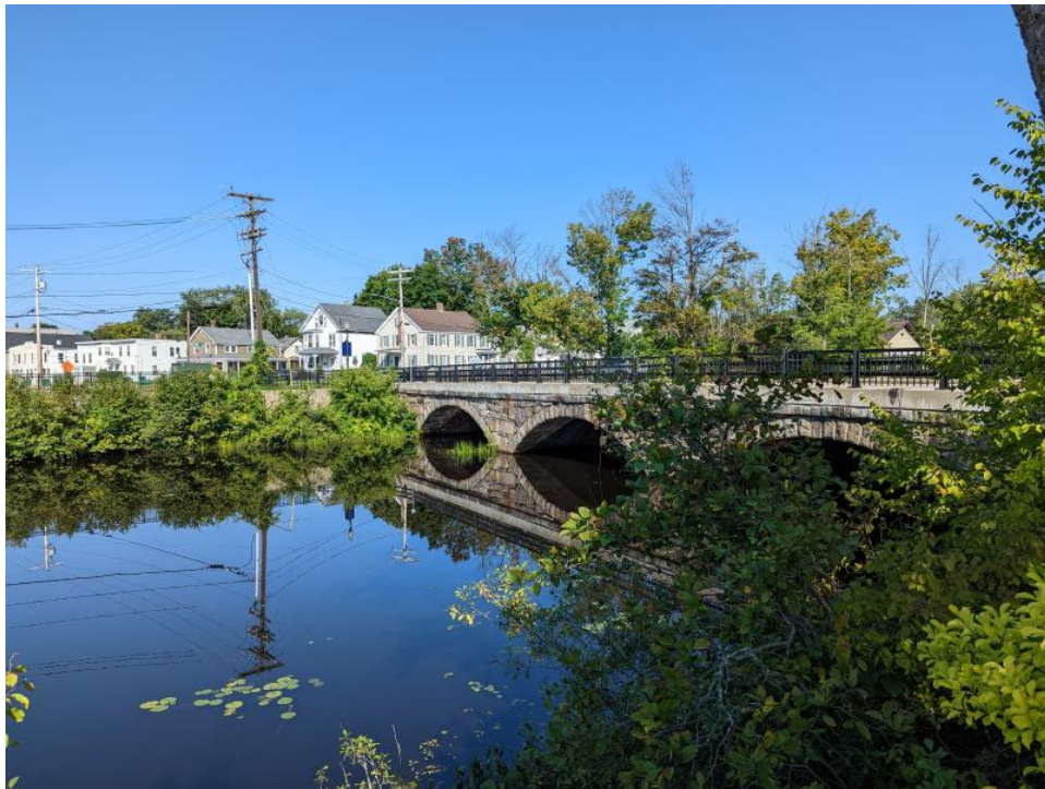
Arched bridge located downtown