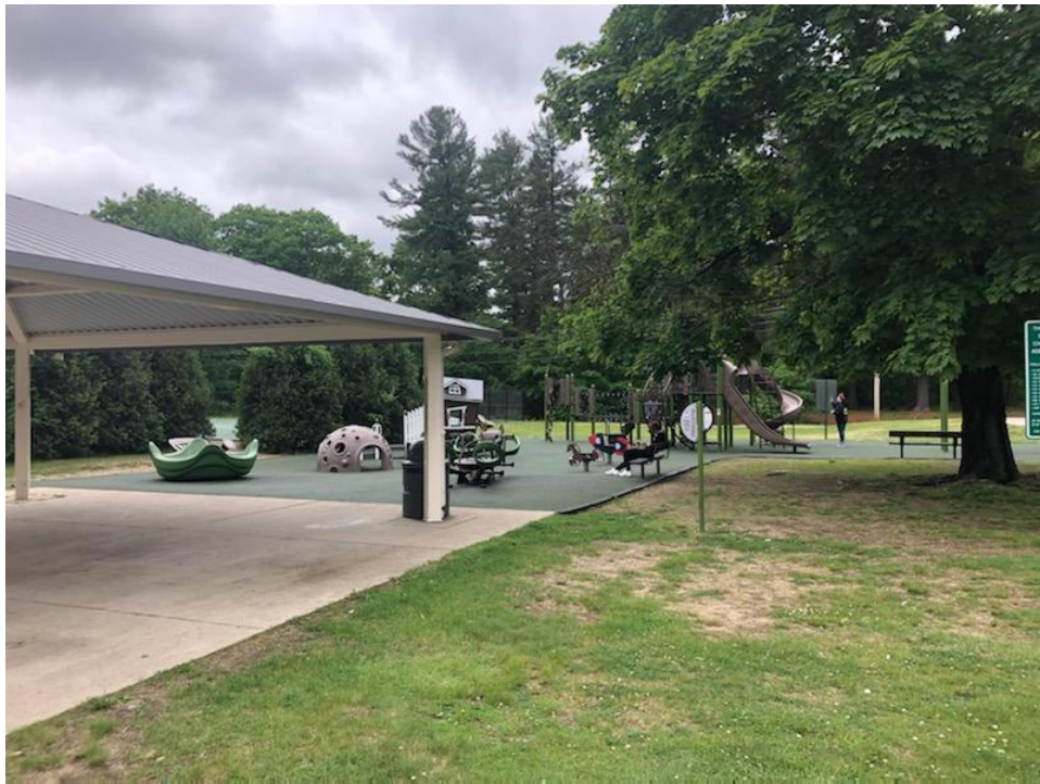
Park and playground across from Hanson Pines Park.