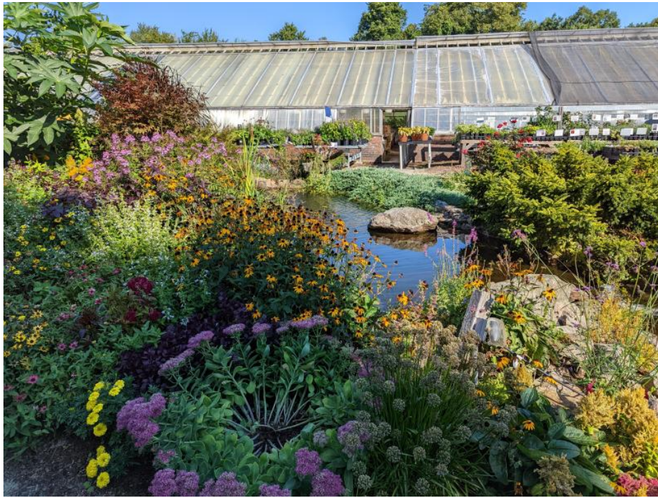
Koi pond with flowers in front of greenhouses.