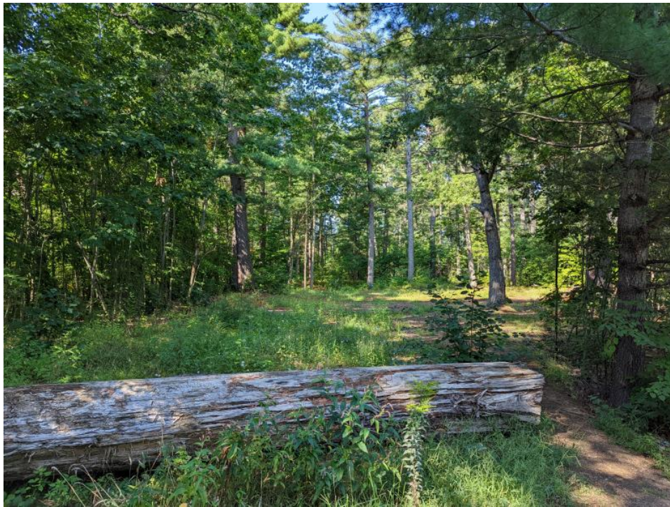
Side entrance to Dominicus Hanson Pines Park.