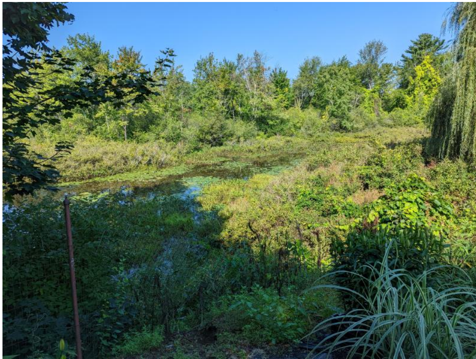
Cocheco River abutting the back end of the business.