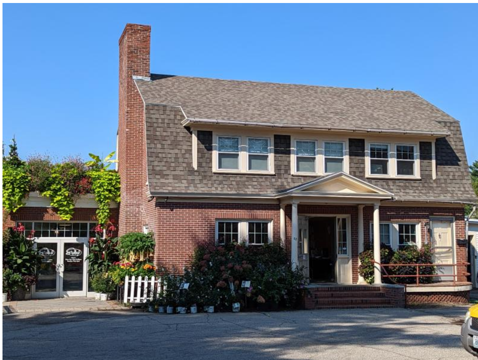
Entrance to Studley Flower Gardens