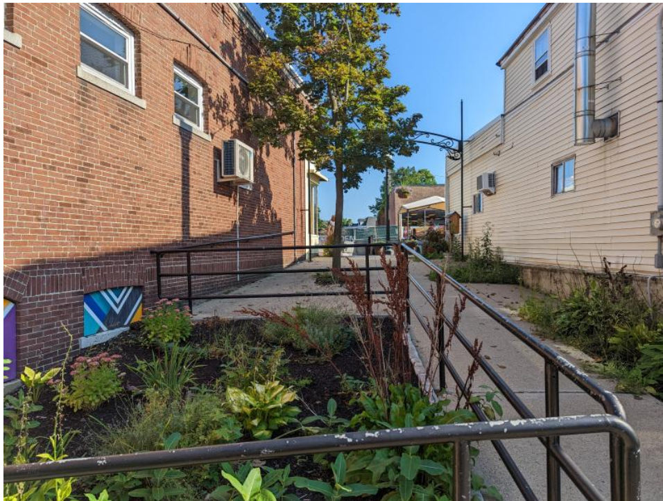
Walking path connecting Cocheco River to downtown Rochester. Construction for a building is currently ongoing near the entrance of the path.