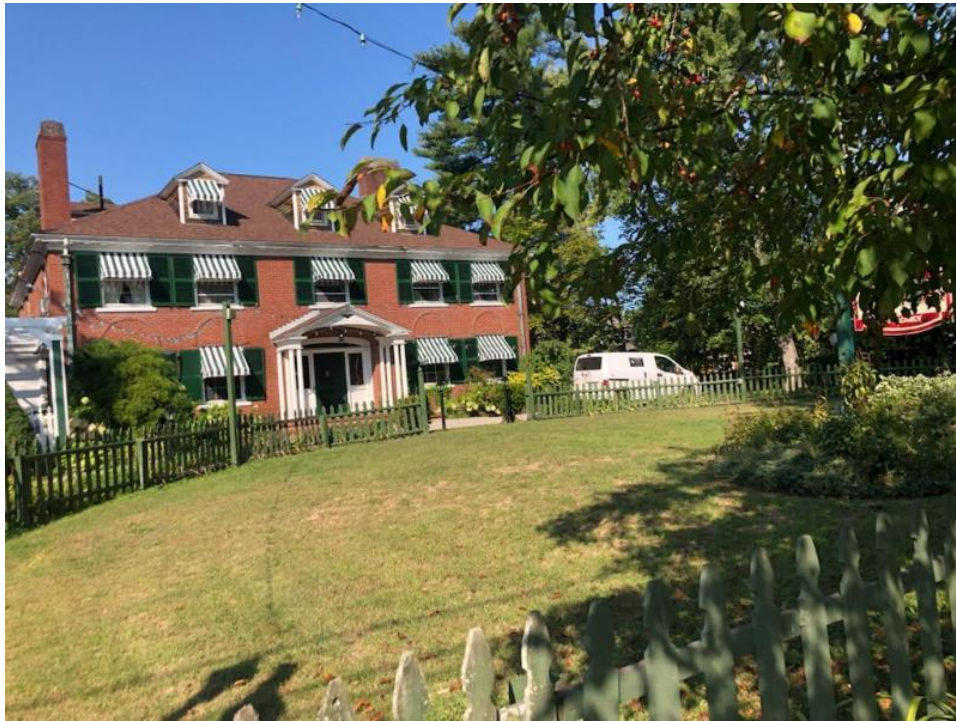
Governor's Inn & Restaurant on walk to Studley Flower Gardens