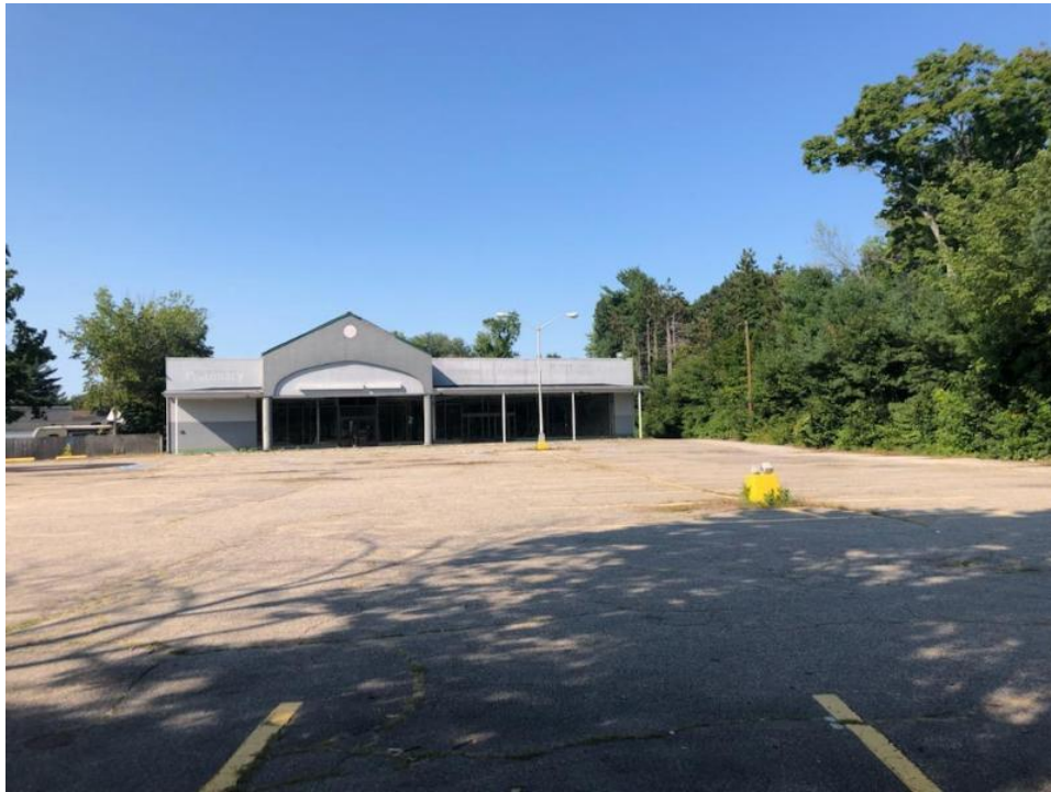
Currently empty building with development opportunities.