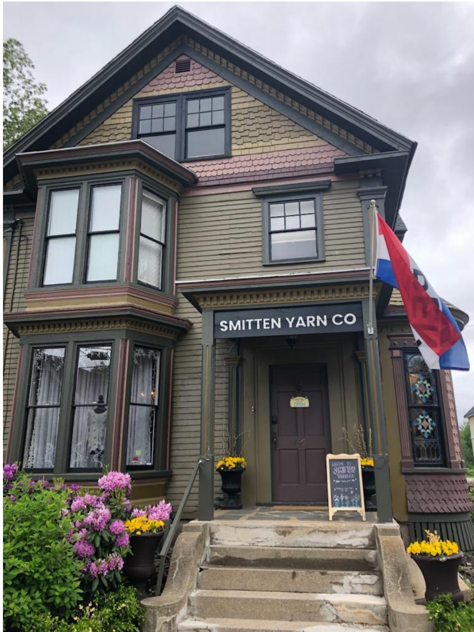
Business located near Studley Flower Gardens.