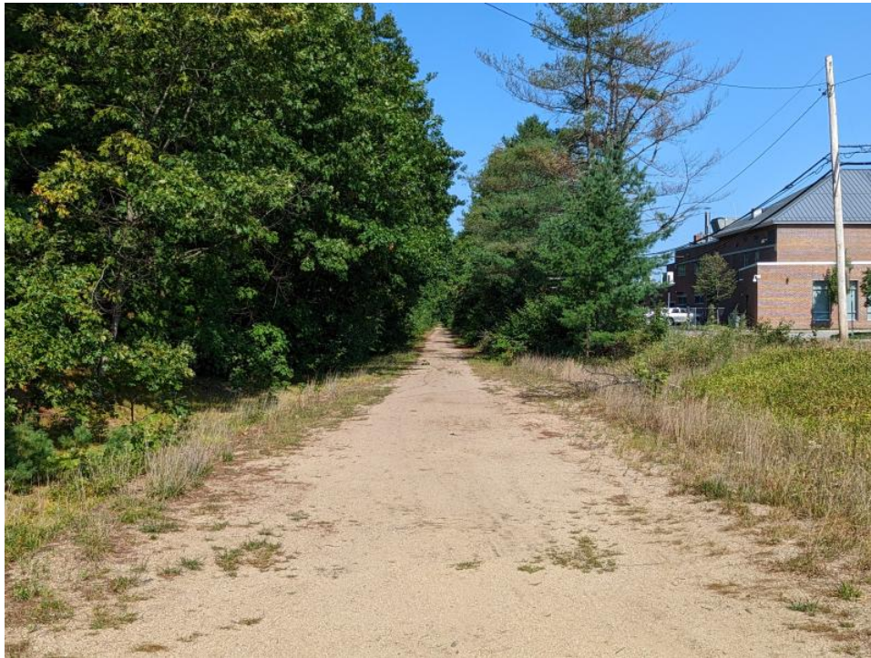
Rail Trail located next to Hanson Pines Park.