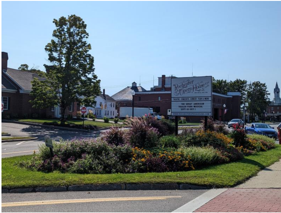
Adopt-a-spot location close to downtown showcasing beautiful flowers and welcoming appearance.