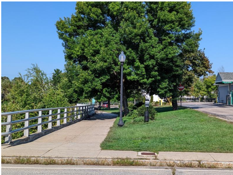
Shaded walking path along river with bistro style seating. Bigfoot can be seen lurking in the background.