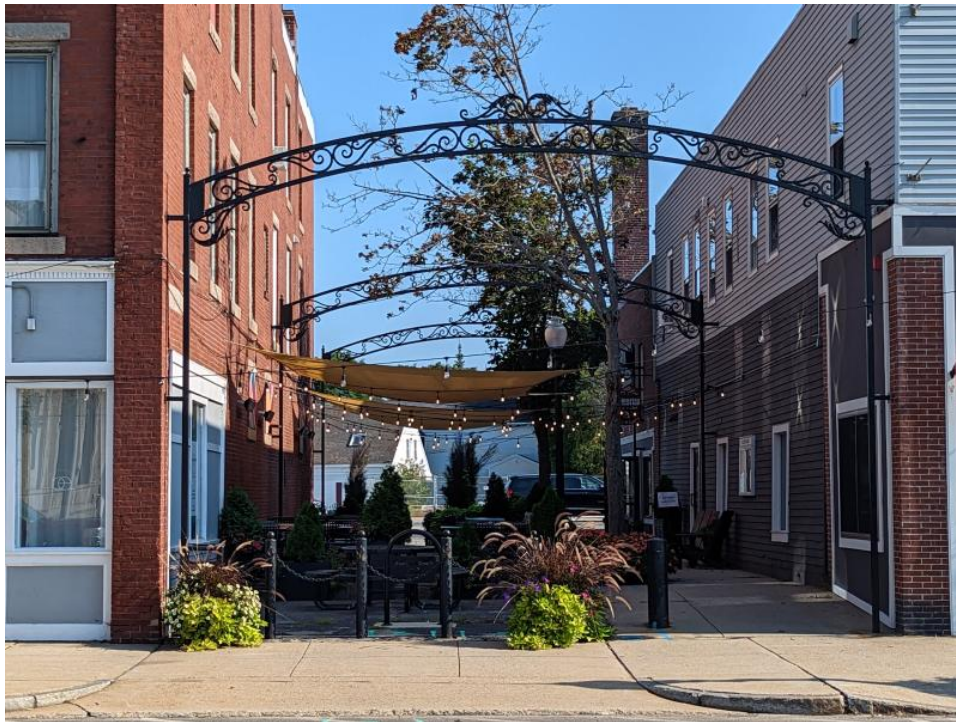
Outdoor seating at downtown restaurant located close to Cocheco river.