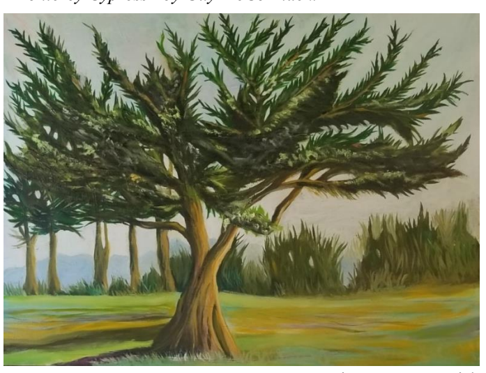
Figure 4 "Monterey Cypress" by Guy McCormack.

"People who are in pain or have other issues can benefit from that," he said. "Pine Forest with Waterfall" (see Figure 5) is an "36 x 36" painting made from oil on canvas.