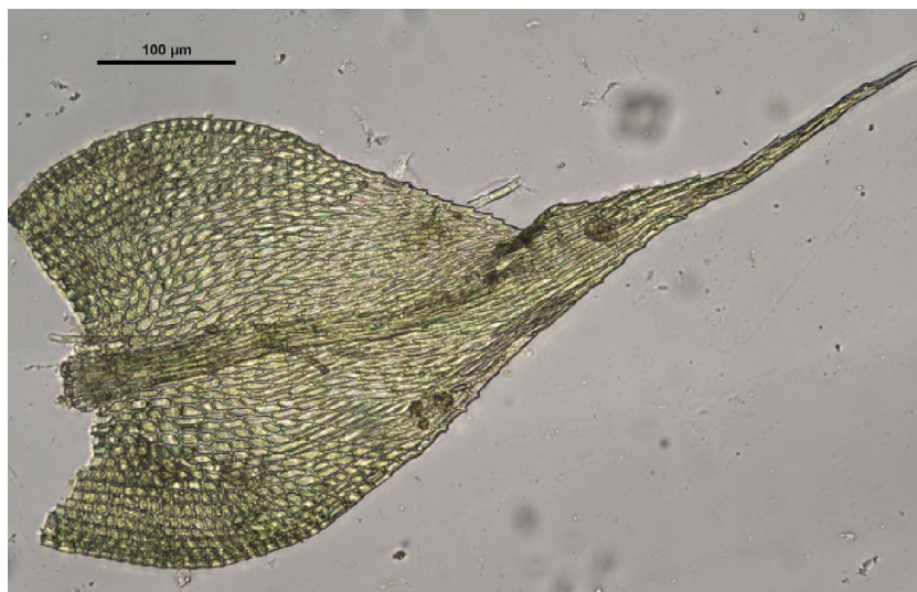
Figure 2. Stem leaf of Scorpiurium sendtneri [Albanian specimen BP 185817 published in Marka et al. (2013) and Papp et al. (2018)].

at base. The branches are up to 0,5 cm long, not curved in dry conditions, which is a characteristic feature of S. circinatum (Pedrotti 2006). There is one more specimen from Montenegro collected by Szepesfalvy at Herceg Novi (Szepesfalvy 1931). However, it was not found in Herbarium BP. Therefore the occurrence of this species in Montenegro is doubtful.