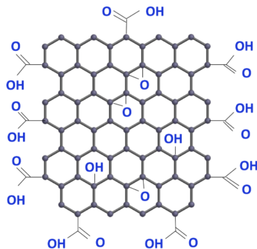
Figure 1. The graphene oxide molecular structure consists of carbon, hydrogen and oxygen.

Graphene has already been proposed by some authors as a key material for the use in fuel cells and electrolyzers. Graphene technology is advancing rapidly, and more applications can be found continually. Graphene oxide can be made from graphite and is claimed to be inexpensive. An example of its molecular structure is shown in Figure 1.