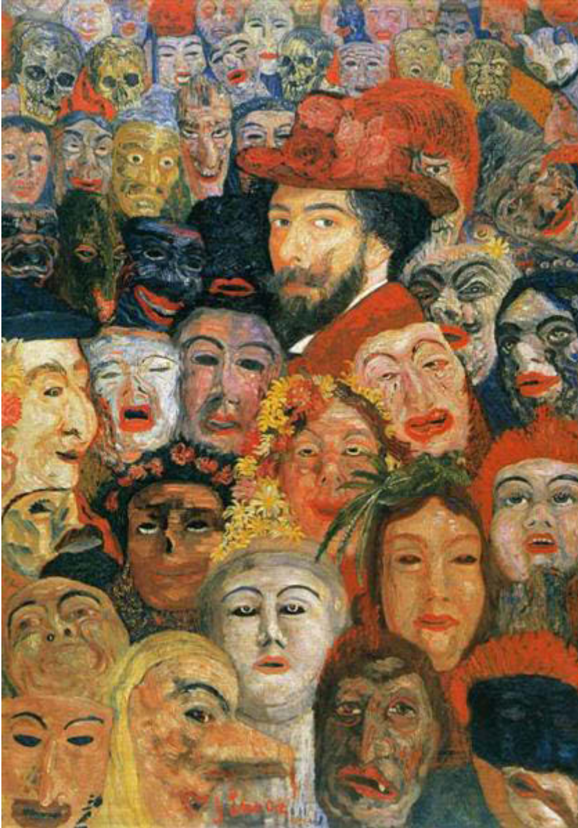
Figure 1: James Ensor's Self-portrait with masks ( https://www.wikiart.org/en/james-ensor/self-portrait-with-masks-1899 ).

instead suggests a release of self in an endless proliferation of masks. Doing so it moves in a direction diametrically opposed to that of Augustine, when he attempts to gather and 'collect' himself out of 'that dispersed state in which my very being was torn asunder because I was turned away from You, the One, and wasted myself upon the many' (quoted in Coyne, 2015: 98).