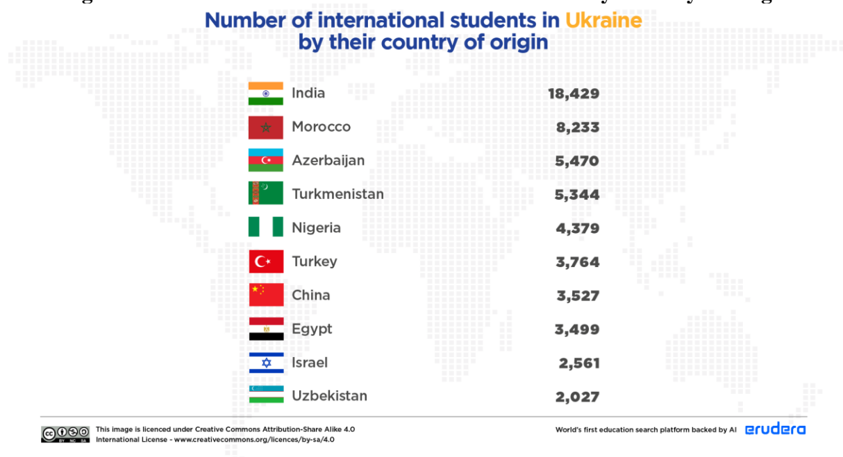
Figure 4. Number of International Students in Ukraine by Country of Origin

Furthermore, the war in Ukraine has significantly limited these students’ ability to travel and return home. The conflict has resulted in the closure of airports and the suspension of flights, making it difficult for students to leave the country. This has caused a great deal of stress and uncertainty for many students, as they are unable to see their families and loved ones. It is estimated that prior to the Russian invasion, around 8,000 students from Morocco, 4,000 from Turkey, 3,000 from Egypt, and many others from different MENA countries were studying at Ukrainian universities. In the wake of the invasion, the governments of these countries attempted to evacuate their students, but Silber and Wilder (2022) claim that thousands of students remained in Ukraine. The same report also stated that some students, including Moroccans, were killed during this war.