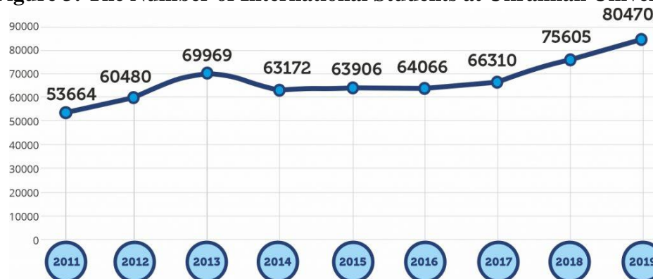
Figure 3: The Number of International Students at Ukrainian Universities

In reference to Ukraine's higher education statistics by Erudera, Ukraine welcomed around 80,470 international students who mostly majored in medicine, medical practice, dentistry, management, and pharmacy ("Ukraine International Student Statistics," 2022). The studies also indicate that in less than a decade, from 2011 to 2019, the number of international students enrolled increased by approximately 50%.