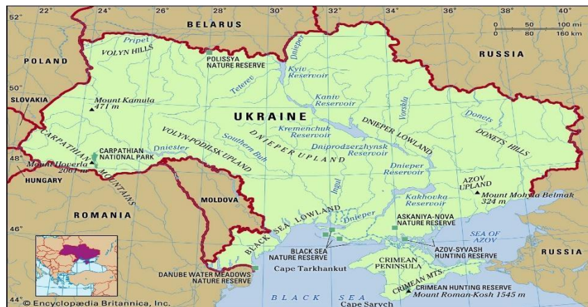
Figure 1: Physical Features of Ukraine