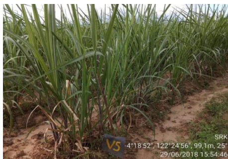
Figure 1. Plant performance in the experimental field at the age of 13 WAP.

At the age of 15 WAP, the Saccharum 'PS864' with a row spacing of 40×100 cm produces the highest plant height growth,