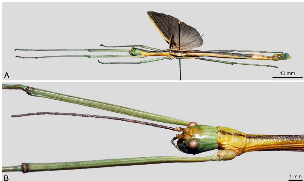
Fig. 1. Ophicrania conlei n. sp., holotype male. (A) Habitus, lateral view. (B) Head, pro- and mesothoracic segments, lateral view.

Comparative material: Ophicrania nigrotaeniatus (Redtenbacher, 1908): ♂, Philippines, Valle de Bulasan (MNCN) (photographs examined). Ophicrania sagittarius Bresseel