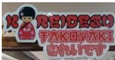
Figure 2 : Kireidesu Takoyaki LOGO

An example of Digital Branding is using a logo that matches the image of the product or brand. So that when consumers see the logo, consumers will immediately recognize and take advantage of the product or brand related to the logo. Here is the Logo of Takoyaki Okonomiyaki Kireidesu as the object of this study.