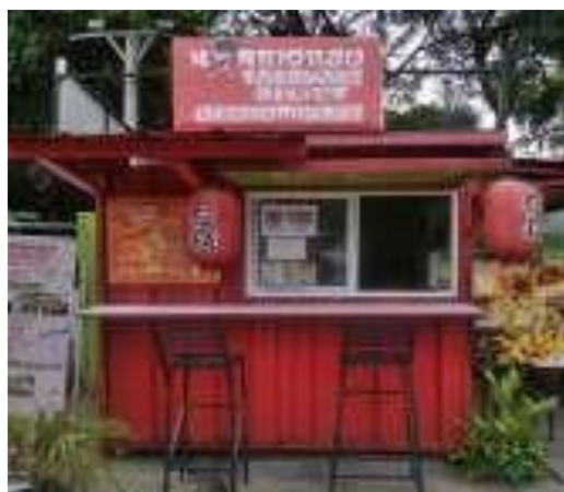
Figure 1: Kireidesu Takoyaki Booth.