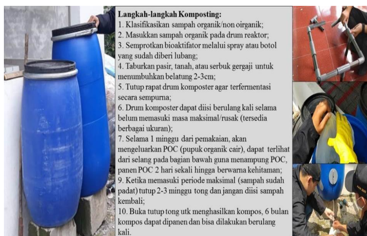
Figure 4. The process of processing organic waste into liquid compost

technologies are used as an effort to deal with waste, starting from reducing waste ( Muhamad et al., 2020 ), to using and recycling waste that is still suitable for use ( Kumar & Samadder, 2017 ). Based on the previous conditions, parties with an interest in waste management in Pasinan Lemah Putih Village use composting technology. This technology is an advanced stage after the implementing team sorts and collects organic waste. Composting itself is a technique that is generally capable of producing compost which is useful as fertilizer for plants and strengthens soil structure with the help of bacteria (microbes) as decomposers. If using natural techniques, composting that is capable of producing compost is generally quite long. However, to speed up the composting process, executors use the help of a special bioreactor, organic matter as a mixture, and a source of microbial decomposers. The scale of composting itself can be done either by households or on a macro scale. For household scale, the technical process can use specially designed plastic drums to simplify and speed up the composting process. Some of the advantages of composting on a household scale include: first, it only uses a narrow area; second, easy to control so as to produce quality compost, and; third, the impact (eg smell) is not too disturbing.