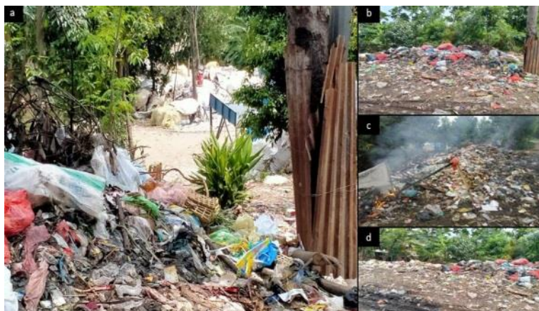
Figure 2. The condition of the waste in the TPA of Pasinan Lemah Putih Village

and man-made resources. According to Law Number 18 of 2008, waste comes from the remains of daily activities or natural processes in solid form. The type of waste itself is very diverse and is divided into organic or biodegradable waste, inorganic or non-biodegradable waste, and toxic/hazardous waste.