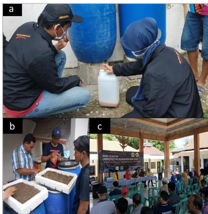
Figure 5. a) The Harvest of POC; b) POC Trial on Plant Seeds; c) Socialization of POC Production

Making liquid compost to produce liquid compost or liquid organic fertilizer (POC) is an effort to use appropriate technology. This technology was adopted for 2 reasons: first, to reduce and process household waste in Pasinan Lemah Putih Village into products of economic value, and; second, increasing the capacity and understanding of the local community in utilizing unused waste. In connection with the purpose of adopting this technology, a form of community empowerment is needed so that people are able to apply simple technology but are able to produce products that are useful and valuable for everyday life. Environmental empowerment itself is intended so that the community is jointly able to overcome environmental problems (such as waste), produce social innovations, and share experiences in creating a beautiful environment in the midst of sustainable development trends ( Avelino et al., 2019 ; Babaci et al., 2015 ; Kaur & Deswal, 2019 ; Kimengsi & Gwan, 2017 ). At the same time, this empowerment also requires a shared will from stakeholders to create effective and efficient waste management ( Cohen et al., 2021 ).