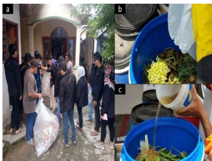
Figure 3. a) Routine of Organic Waste Collection/Separation; b) Organic Waste Entry Process; c) Composting Process by Karang Taruna Desa