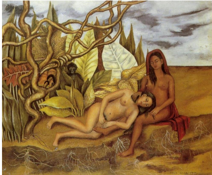
Image 3 Frida Kahlo (1907-1954). Dos desnudos en el bosque (la tierra misma) (1939). Oil on metal.

affair. Her creative decision to depict this relationship as they are nude in a forest fits into the national move towards naturalist themes and her interest in expressing her sexuality. In a discussion about the painting, in which she is supposedly represented as the fair woman, del Río