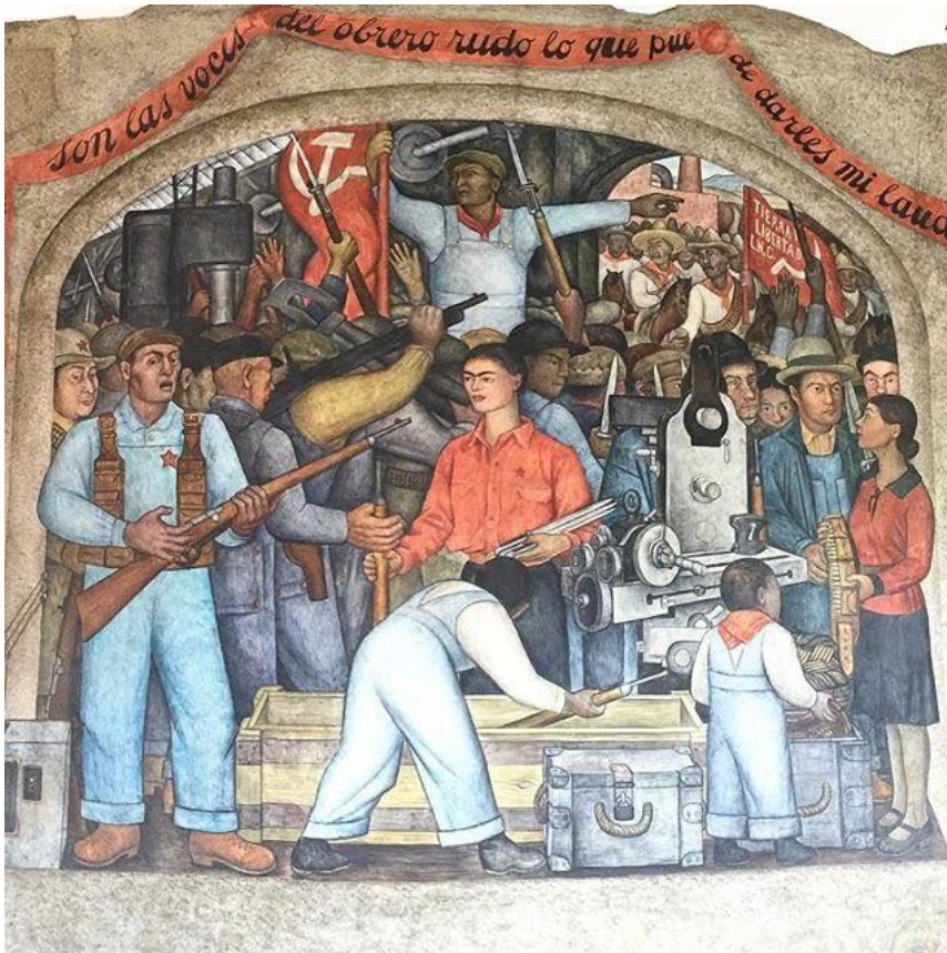
Image 4 Diego Rivera (1886-1957). Ballad of the Revolution mural (1926). Ministry of Education in Mexico City.

supplier of material support to publicly romanticize their embodiment of egalitarian ideals. Kahlo had the benefit of youthful energy and zeal to maintain her energy when she first joined the PCM, but her political involvement did not falter as the years and conflicts unfolded.