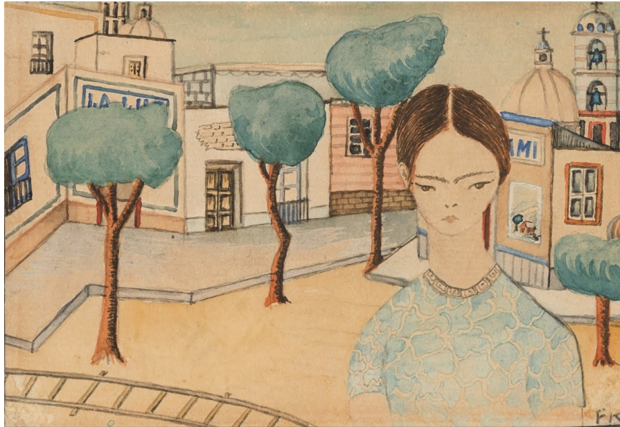
Image 8 Frida Kahlo (1907-1954). Frida Kahlo en Coyoacán (1925-27). Watercolor on paper.