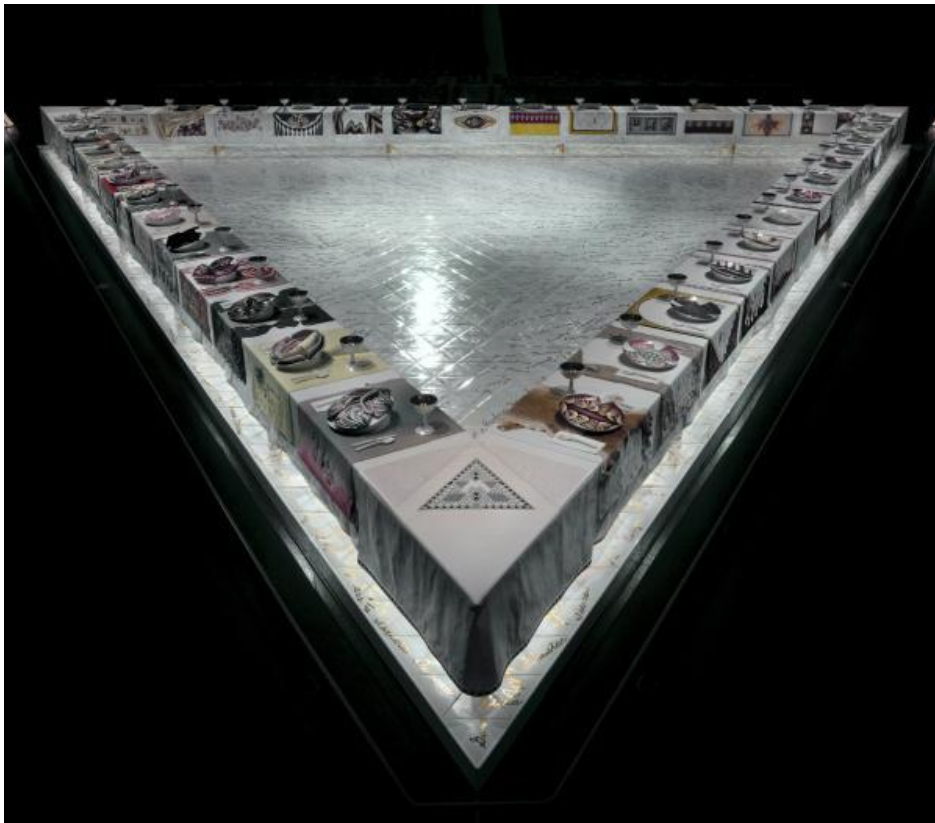
Image 13 Judy Chicago (b. 1939). The Dinner Party (1974-79). Ceramic, porcelain and textile.

in interpersonal dynamics, politics, and the workforce (Burkett). In stark contrast to this work is Faith Ringgold's 1993 book Dinner at Aunt Connie's House . The story details the excitement of