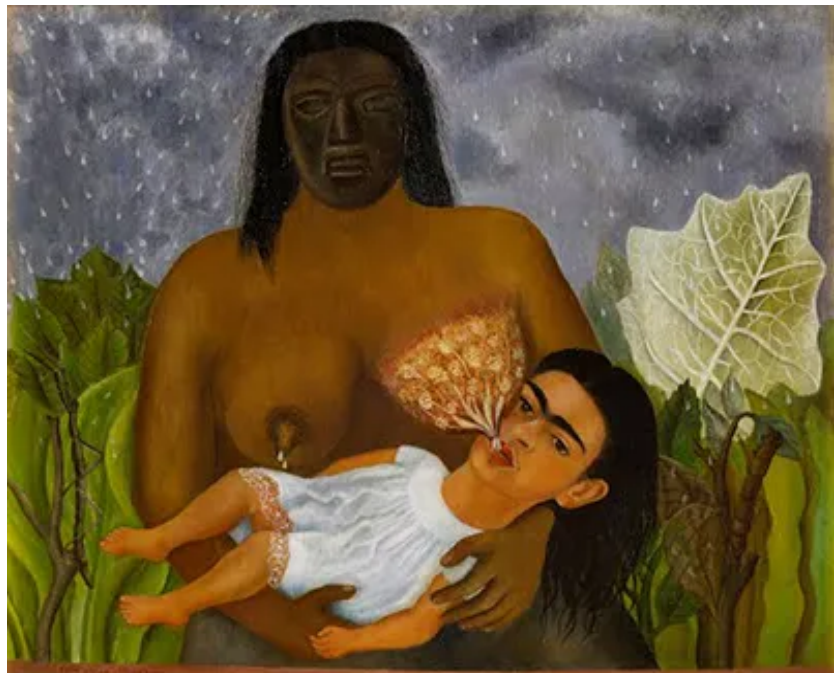
Image 1 Frida Kahlo (1907-1954). Mi Nana y Yo (1937). Oil on metal.

Evidence of the strict social hierarchies present at large in Mexico were evident in the microcosm of the Kahlo family early on when she was breastfed by an Indigenous wet nurse. This short-lived dynamic is immortalized in her 1937 painting titled "Mi Nana y Yo," which translates to "My Nurse and I." Since her mother Matilde was unable to breastfeed, an