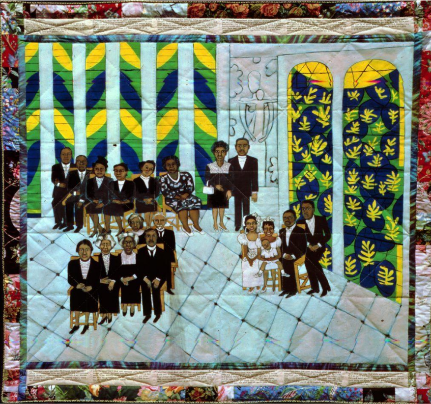
Image 10 Faith Ringgold (b. 1930). The French Collection #6 Matisse's Chapel (1991). Acrylic on canvas with pieced fabric border.

The reference to Henri Matisse is a powerful decision that Ringgold executes masterfully. Her careful recreation of a work within the Western canon is incorporated in recognition of the