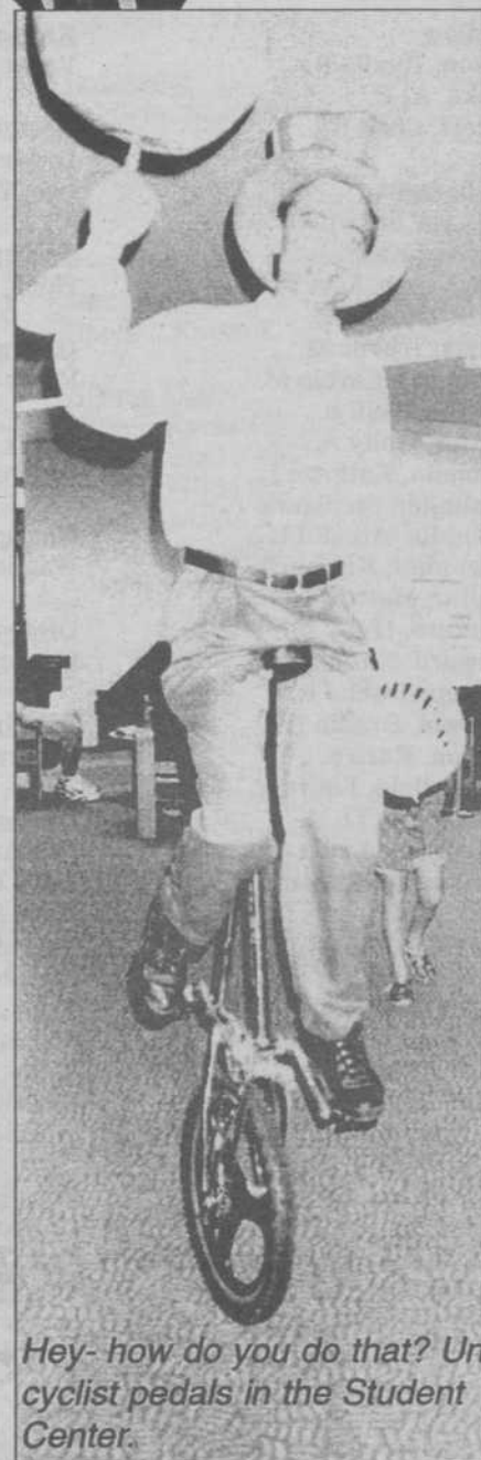
Hey- how do you do that? Unicyclist pedals in the Student Center.