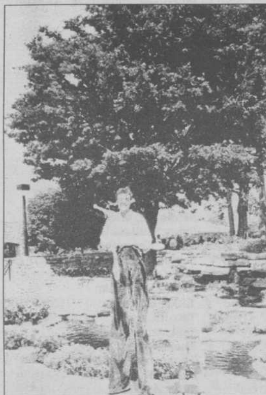
"Circus Boy" and an admirer pause for a moment in the fountain area.