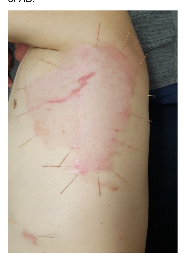
Figure 3a. and 3b. (below) Photo taken by the therapist and reproduced with consent of AB.