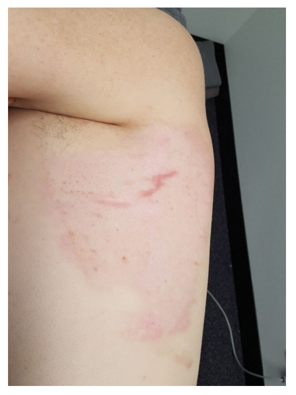
Figure 4. (left) Photo taken by the therapist and reproduced with consent of AB.