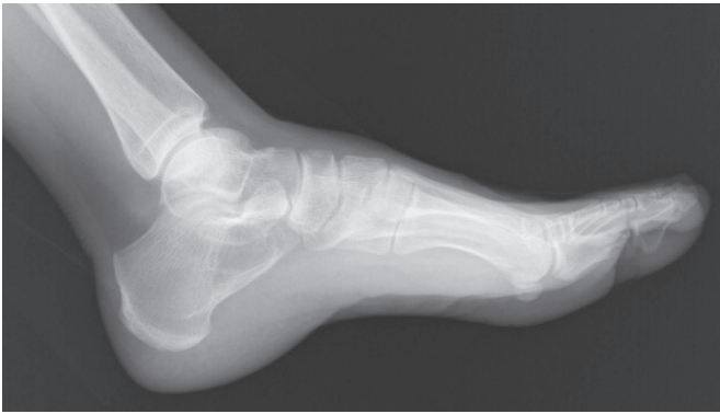
Figure 1: Lateral preoperative X-ray of a calcaneal lipoma