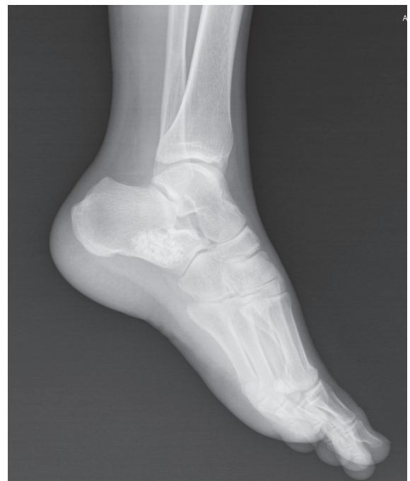
Figure 4: Lateral postoperative X-ray of a calcaneal lipoma