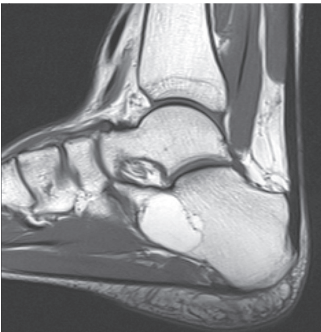
Figure 2: Sagittal T2 MRI image of a calcaneal lipoma