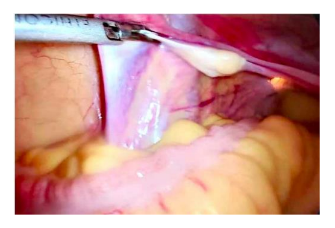
Figure 1: Laparoscopic view of the gonad.

hypogonadism with a 46XY karyotype helped to pin the diagnosis of Swyer syndrome. The patient was then planned for laparoscopic bilateral gonadectomy due to risk of malignancy in future. Examination under anesthesia showed a well-developed cervix. On laparoscopy hypo plastic uterus was seen with bilateral streak gonads (Figure 1). Bilateral gonadectomy was done and gonads were retrieved in a glove bag. Post-operative period was uneventful, and patient was discharged after observation for 24 hours. On histopathological evaluation, presence of gonadoblastoma was detected in the gonads with no evidence of malignant transformation (Figure 2). Patient was started on hormonal therapy post-surgery. At 6 months of follow up patient is doing well.