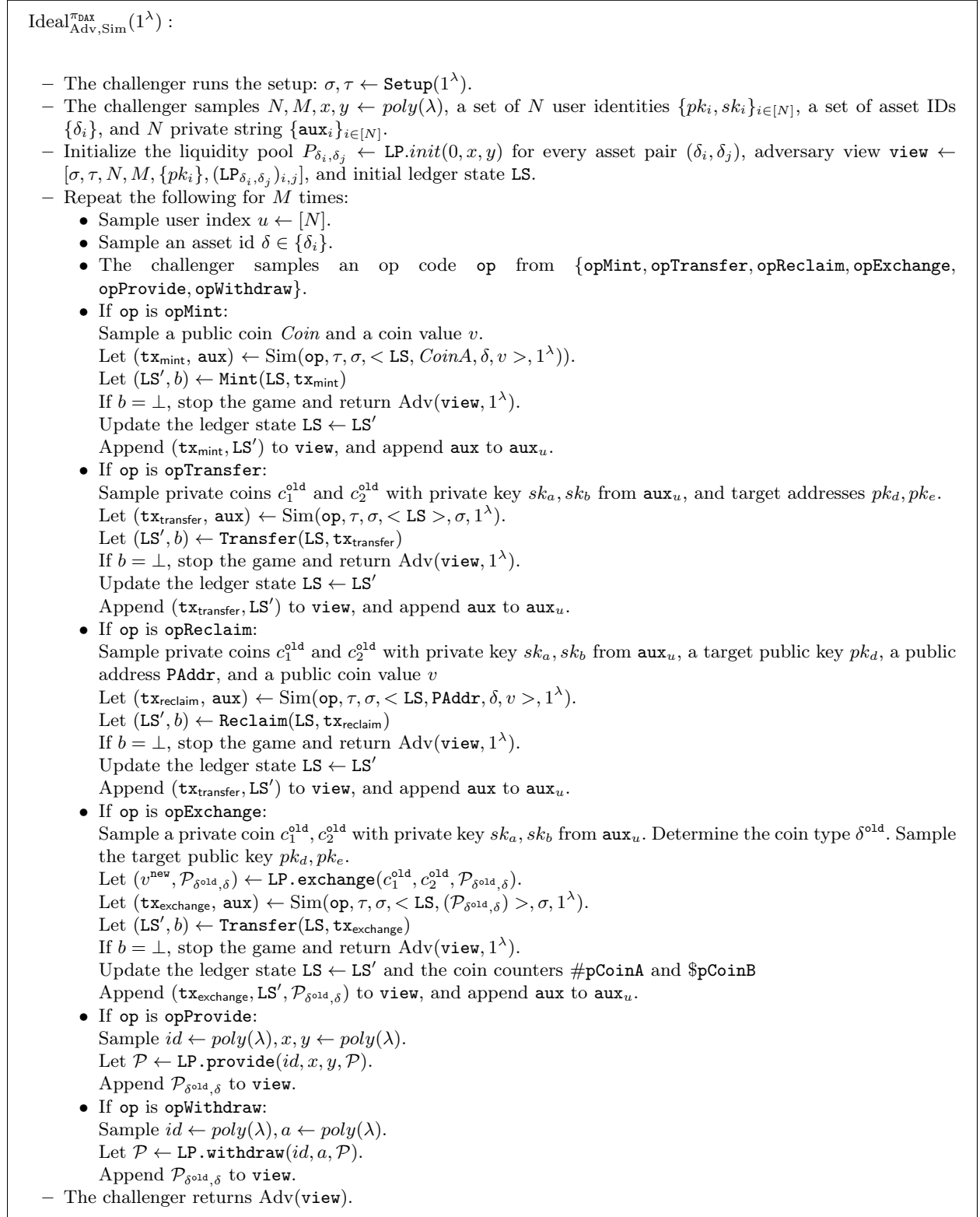
Fig. 7: Experiments \text{Ideal}_{\text{Adv, Sim}}^{\pi_{\text{DAX}}}(1^\lambda)