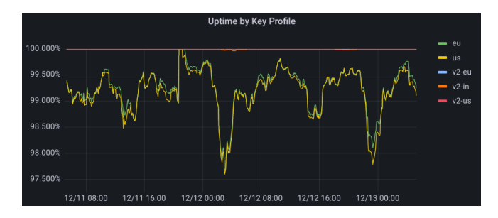
Figure 3: Uptime by policy; this shows that Portunus (v2) has consistently better uptime than Geo Key Manager (v1)

Table 3 shows the average time required to perform different key operations. Key generation refers to the process of generating attribute secret keys from the master secret key, which can be performed out-of-band of user handshakes and is therefore of marginal relevance in this context. Encryption latency can also largely be ignored, as it is acceptable for encryption to take a few extra cycles before a certificate is considered deployed. But once it is deployed, HTTPS requests to the website should complete quickly. Since decryption is in the critical path of every request, it is the most pertinent in our situation. While session resumption and caching policy keys can amortize the number of ABE decryptions across TLS handshakes to a small fraction, improvements to decryption latency will still affect overall baseline performance. It is therefore important to further optimize the decryption process.