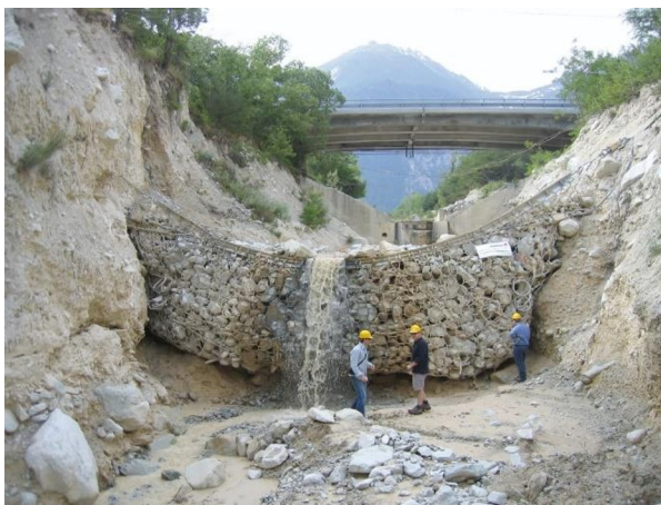
Fig. 1 Debris flow flexible barrier

The proposed methodology is delineated in Sec. 2, while its limitations and advantages are discussed in Sec. 3. Finally, conclusions and future perspective are outlined.