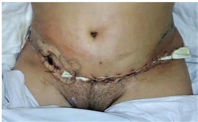
Figure 2. Rapid progression of the lesion, with worsening of hyperemia and appearance of ulcers of irregular edges with necrotic center.

Computed tomography was performed to evaluate abdominal wall infiltration and exclude the necrotizing fasciitis hypothesis. No new subcutaneous collections or infiltrate scans away from the surgical wound were identified on imaging. Clinically, however, it presented considerable worsening of abdominal lesions, with extremely rapid and important progression. Ulcerated lesions adjacent to the operative incisions, with irregular and violaceous edges, with a necrotic center, whitish, softened and extremely friable, with drainage of purulent secretion, in addition to heat, local pain and drainage of purulent secretion (Figure 2).