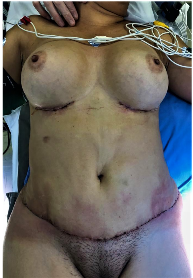
Figure 1. Aspect of the abdomen on arrival at the Hospital de Clínicas de Porto Alegre. Evident hyperemia on bilateral flanks, local heat, edema/major infiltrate, and secretion drainage. Better-looking mammary incisions, but with secretion drainage. Pre-debridement.

On the 11th postoperative day, she sought the emergence of HCPA under his assistant plastic surgeon's guidance for edema, heat, hyperemia, and pain on flanks bilaterally with secretion drainage and persistent fever above 38°C. The patient arrived at the tachycardic emergency, pale, with borderline blood pressure (102/59mmHg), saturating 94-96% and febrile. On physical examination, cutaneous infiltration with edema, heat and important hyperemia was identified in lateral parts (flanks) of the abdominal incision, in addition to hyperemia and drainage of secretion in incisions of augmentation mammoplasty (Figure 1). Intravenous antibiotic (amoxicillin-clavulanate was initiated, subsequently staggered to cefepime and vancomycin under the guidance of the hospital infection control committee). Laboratory tests corroborated the infectious process hypothesis: C-reactive protein (CRP) 417.6mg/L, 32,310/ \mu L leukocytes with 8% of sticks, 593,000 platelets and lactate 0.79mmol/L.