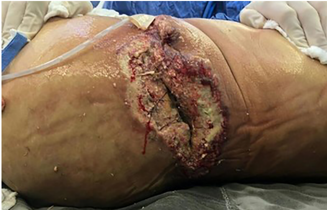
Figure 4. Involvement of the left flank.

for mycobacteria, was collected again. Fragment of debrided tissue was sent for anatomopathological examination. Cultural examinations (including for mycobacteria) had a negative result. Histopathological examination was non-specific: acute suppurative inflammation in the dermis and hypodermis (cellulitis), in addition to lipophagic granuloma.