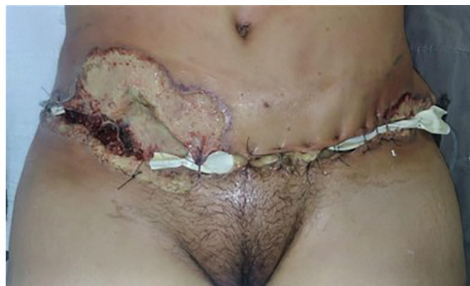
Figure 3. Progressive and rapid worsening of devitalized areas. Photo taken after 48 hours of the second surgical debridement.

The patient showed little clinical improvement in the days following the new surgical intervention; she remained febrile, with increased leukogram and CRP, tachycardic and in need of vasoactive drugs, even at lower doses. There was progressive worsening of the necrotic areas, presenting the same aspect described previously (Figure 3). The worsening progression was rapid; in less than 12 hours, ulcers of violaceous edges were already identified, with a necrotic center, especially on the flanks (Figure 4). On the other hand, the incisions for removing breast prostheses evolved well, with good healing, without warning signs.