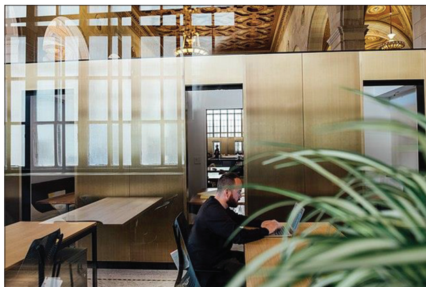
Figure 1. Working in open office space, Royal Bank Tower, Montreal, 2017.

Biophilic design encompasses a range of elements that aim to integrate natural features and processes into the built environment (Table 1). These elements include natural light, which is achieved through abundant windows, skylights, and light wells, creating a connection with the outdoor environment, enhancing visual comfort, and supporting circadian rhythms (Kellert, 2008). Views of nature provide access to natural elements such as vegetation, landscapes, or water bodies, promoting relaxation, stress reduction, and cognitive restoration. Biomorphic forms and patterns, such as organic shapes and fractal patterns, mimic elements found in nature, evoking positive emotional responses and increasing visual interest (Kellert et al. , 2011). Integrating living systems, particularly indoor plants, not only improves air quality but also enhances well-being and fosters a sense of connection with nature. Using natural materials, such as wood, stone, and natural fibers, in building construction and interior finishes, evokes warmth and authenticity, creating a welcoming and harmonious environment. Water features, such as fountains or water walls, provide sensory stimuli and promote relaxation and tranquility. Thermal and ventilation variability, mirroring natural conditions with varying temperature and airflow,