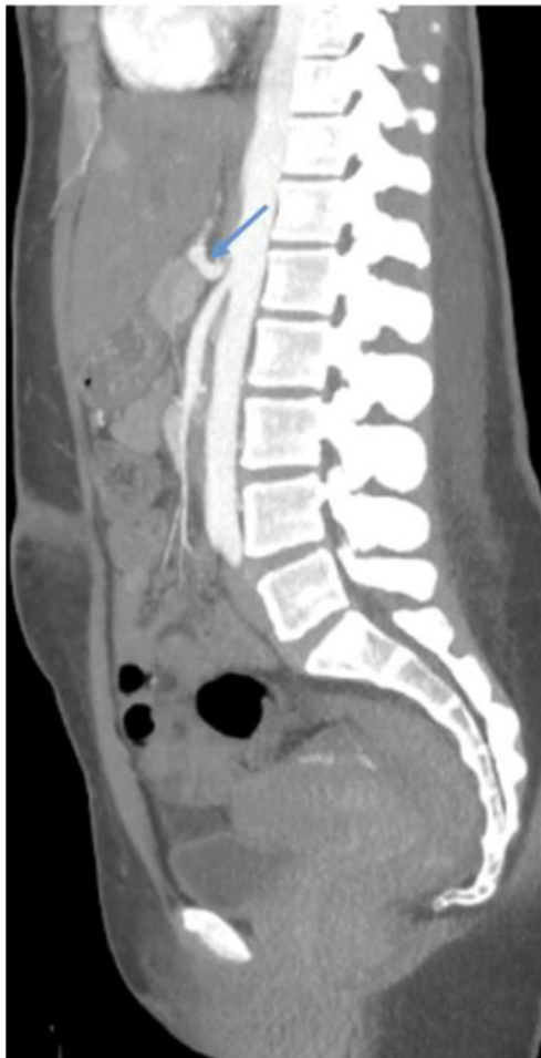
Fig. 1. Sagittal contrast enhanced CT through the abdomen and pelvis reveals the classic hooked celiac sign with post-stenotic dilation (blue arrow), indicating compression of the celiac artery.

The celiac artery normally arises from the aorta at the T12 level, just below the origin of the median arcuate ligament. 1 MALS occurs when either the median arcuate ligament arises lower than usual or if the celiac artery arises higher than usual, leading to celiac artery compression. The disease is more common in individuals with thin body habitus and in females between 30 and 50 years old. 2