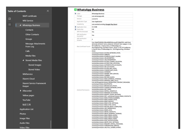
Figure 5. Examination results scenario 2

Figure 4 shows the report.pdf document, presented directly by the MOBILedit Forensic Express forensic tools. Various kinds of smartphone information become electronic evidence in this study. The contents of the report.pdf are shown in Figure 5.